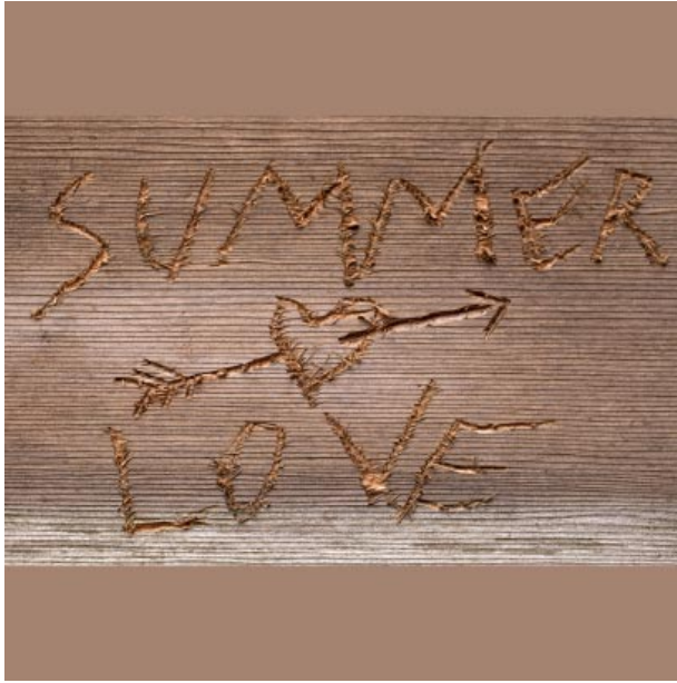
"Summer Love" on view now at The Front Room Gallery

It all started with Frida and Diego, Burton and Taylor, Lee Miller and Man Ray. Artists influence each other, destroy each other, love passionately. Out of all this, creating is born. Partners in crime. Partners in life. Dali signed his paintings with his and his beloved's name. It is said that she saved him from his own misery, "it is mostly with your blood, Gala, that I paint my pictures." That's what immediately came to mind when I saw the The Front Room Gallery group show "Summer Love"—a sudden, sensual, and very intimate feeling. Butterflies or maybe cramps, soft knees and sweaty lips, blurred vision & intoxication.