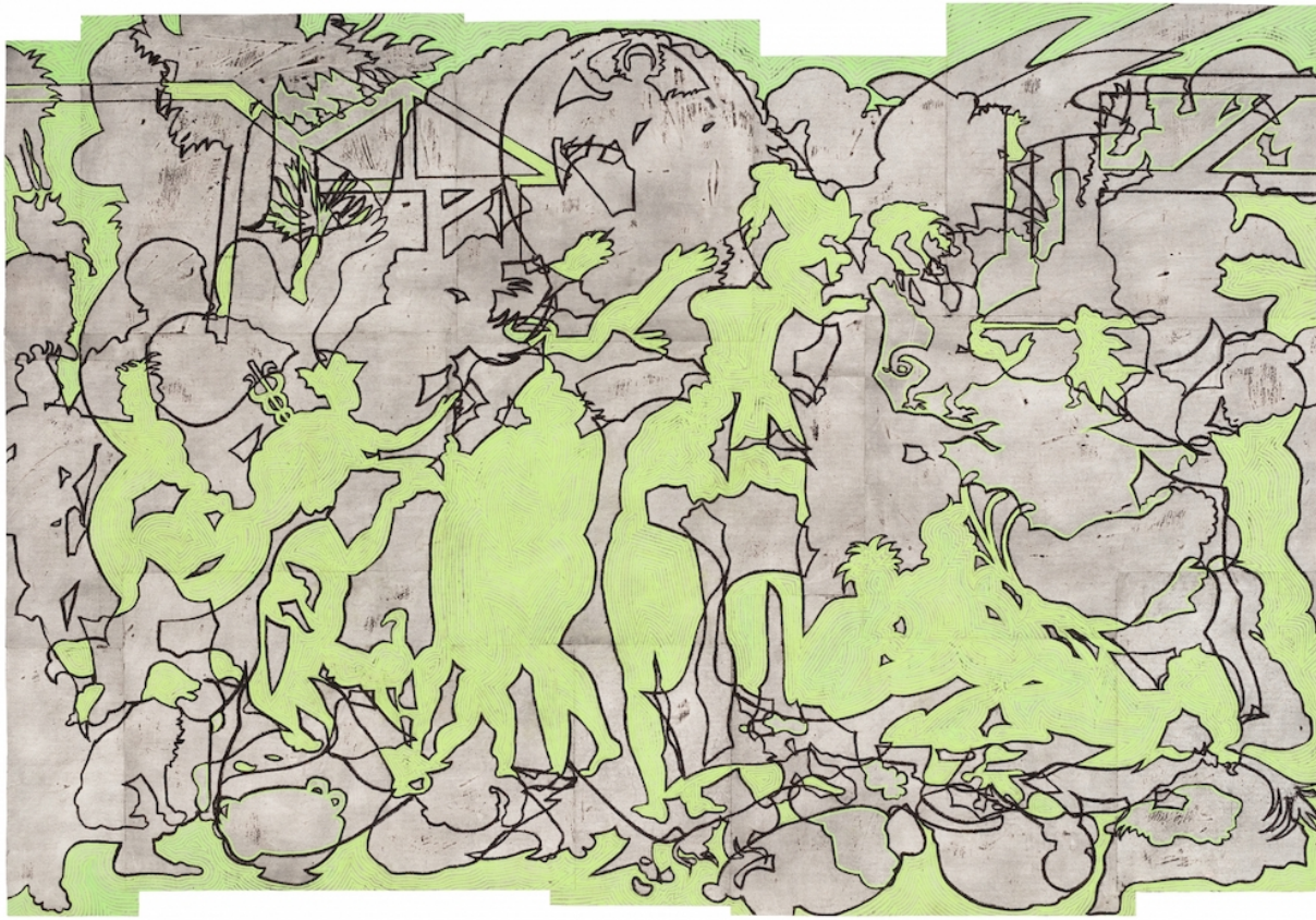
Bo Joseph, Chasing Ghosts, 2019. Oil pastel, acrylic and tempera on joined paper. 55 3/4 x 80 3/8 inches

“The means of war have changed, but the rules have stayed the same... . Battle leads to the ideological catharsis that comes with war,” the gallery’s website quotes Joseph. In the artist’s discussion, Joseph mentioned that the pieces do not refer to a specific historical tapestry or scene; rather, they’re inspired by the genre. Look at each piece long enough, though, and familiar elements stand out — a medieval-esque trumpet in Feeding the Beast , the Rod of Asclepius in Chasing Ghosts , weapons like swords and spears held aloft in Colony Collapse . The tension between the silhouetted figures and the space around them is palpable.