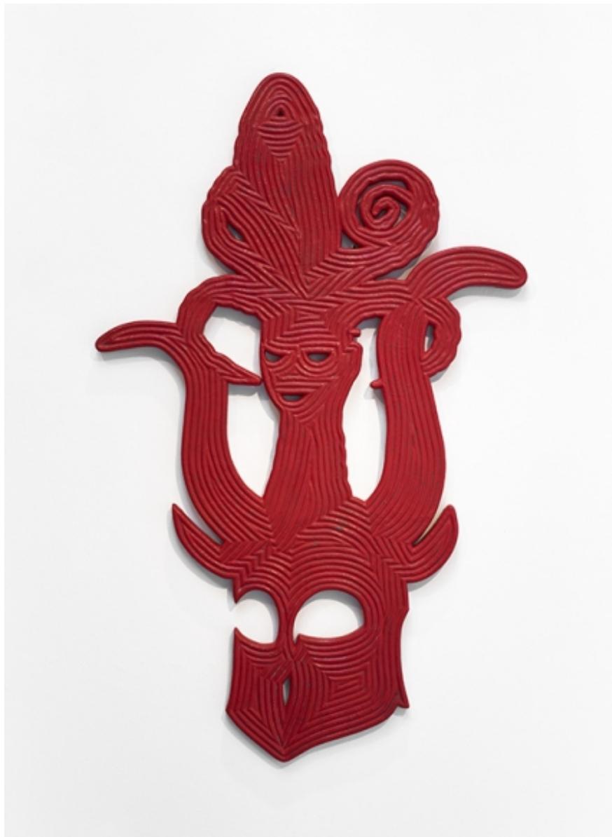
Bo Joseph, Catching Ghosts: Anima/Animus, 2020. Casein and acrylic on resin, fiberglass and foam. 60 x 37 1/2 x 1 1/2 inches

The wall reliefs sculptures in the exhibition are portmanteaus of various global mythos and cosmologies. These works, all from 2020, are casein and acrylic on resin, fiberglass, and foam. As symbolic composites, it's easy to find the non-Western inspirations and iconography that underscores Joseph's work, like West African masks or Persian mythical creatures. Simorgh , for example, takes its inspiration from Farid ud-Din Attar's 12th-century poem A Conference of the Birds . Joseph's interpretation of the poem and simorgh legend vertically juxtaposes four different birds from four different cultural traditions.