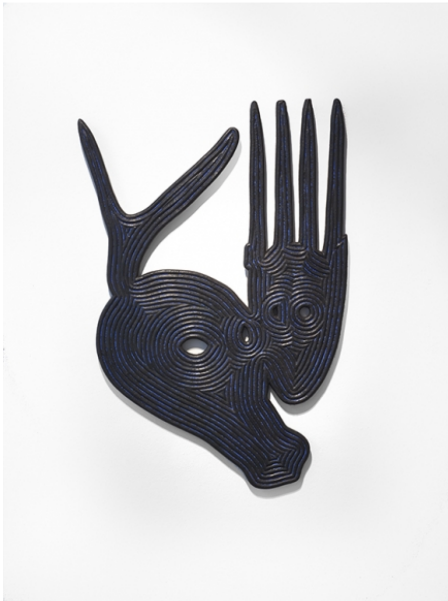
Bo Joseph, Catching Ghosts: Shadow Aspects, 2020. Casein and acrylic on resin, fiberglass and foam. 48 x 33 1/8 x 1 1/2 inches

One of the themes that underscores the exhibition is appropriation, reinterpretation, and how stories are told and retold over time. The Battle with Sagittary and the Conference at Achilles' Tent , for example, is the ancient Greek myth told through the experiences of 15th-century artists; shadows of those same stories appear in Joseph's work more than five and a half centuries later. These oft-told stories form tropes (like The Illiad , or the myth of the simorgh) that in turn become cultural palimpsests — social texts where each telling is superimposed on its previous iteration.