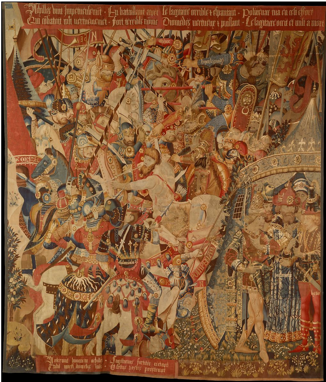
The Battle with Sagittary and the Conference at Achilles' Tent (ca. 1470-90, Tournai, South Netherlands).

The Battle with Sagittary and the Conference at Achilles' Tent (ca. 1470-90, Tournai, South Netherlands), for example, is a fifteenth century tapestry that is so busy and full of movement that it's hard to find a place to rest one's eyes. A spear here, a horse there; trumpets point upward, soldiers brandish their swords, blows are exchanged, and a centaur shoots his bow with a quiver of arrows still on his back. It's an interpretation of a scene from The Illiad , with all of the trappings of European medieval pageantry. The battle is a frenzy.