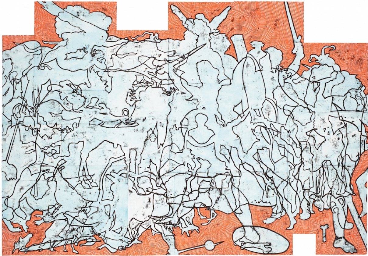
Bo Joseph, Catching Ghosts: Shadow Aspects, 2020. Casein and acrylic on resin, fiberglass and foam. 48 x 33 1/8 x 1 1/2 inches