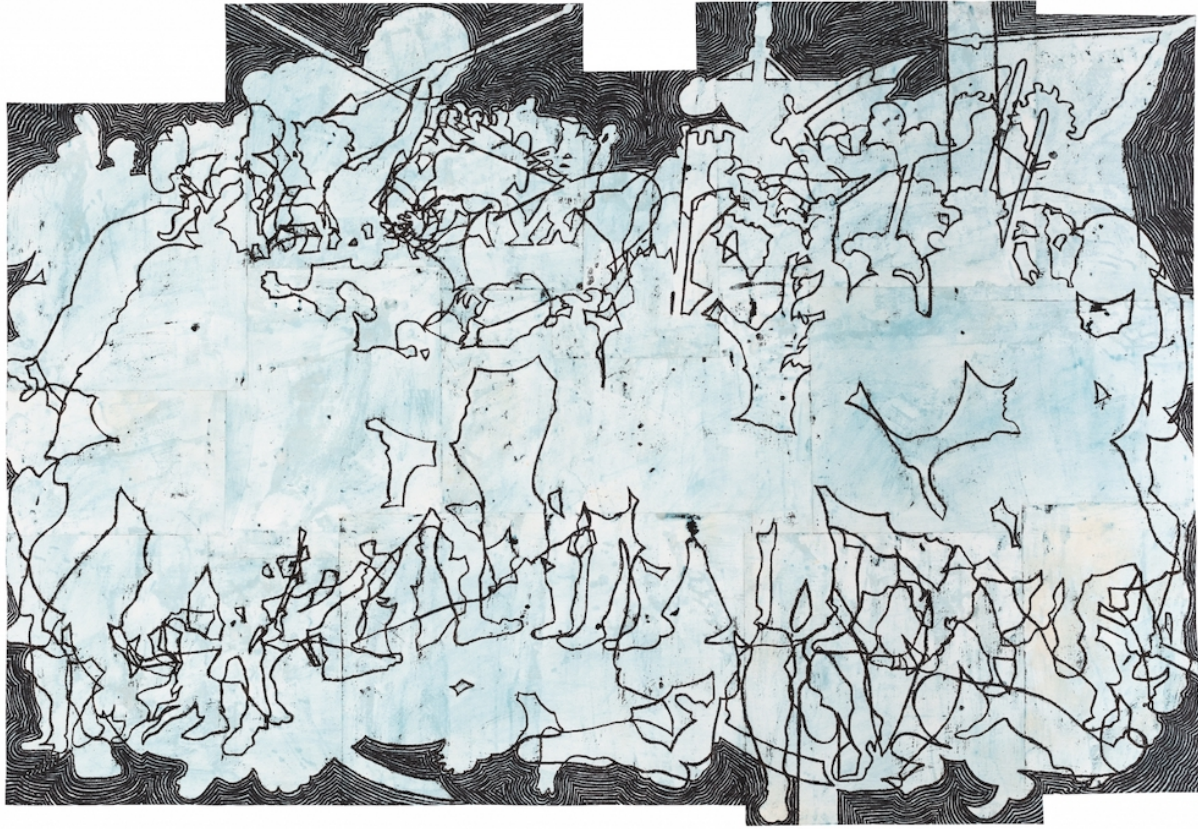
Bo Joseph, Colony Collapse, 2019. Oil pastel, acrylic and tempera on joined paper. 55 3/4 x 86 5/8 inches

Feeding the Beast is Bo Joseph's third solo exhibition at the McClain. The name of the exhibition, Joseph explains on an artist's Zoom talk hosted by the gallery, carries a double meaning. On a personal level, it refers to nourishing his own artistic passion; on a larger scale, it connotes how society pursues its insatiable obsession with profit and progress.