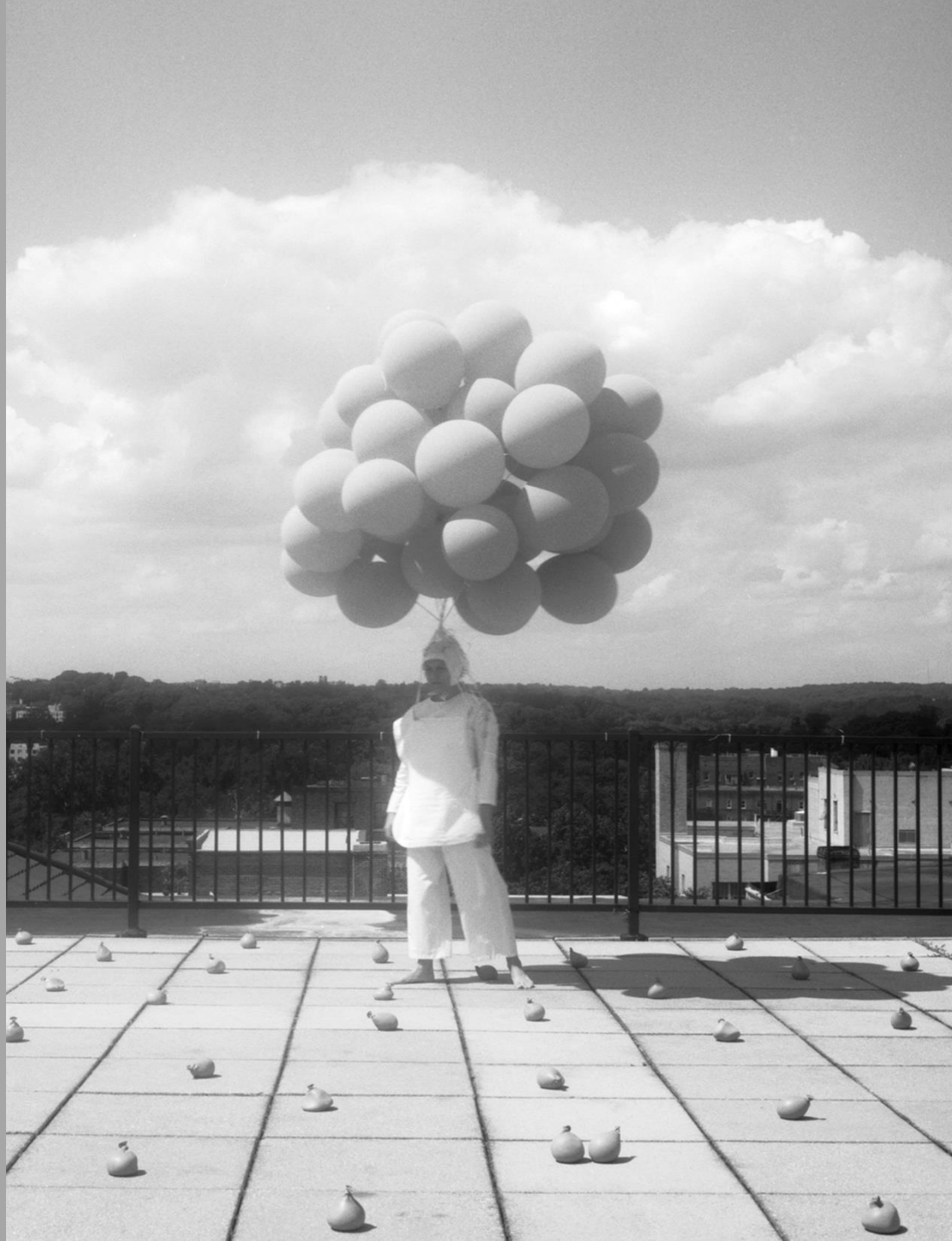
Gather / Shed / Lift , 2 ¼ black and white production photo from Lift , 2005. More information can be found here .