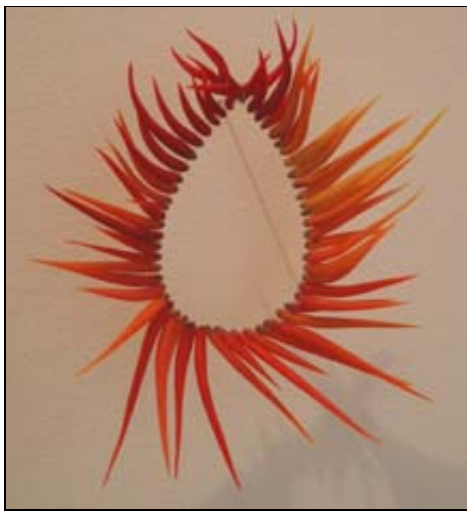
EllenGeorge at PDX.