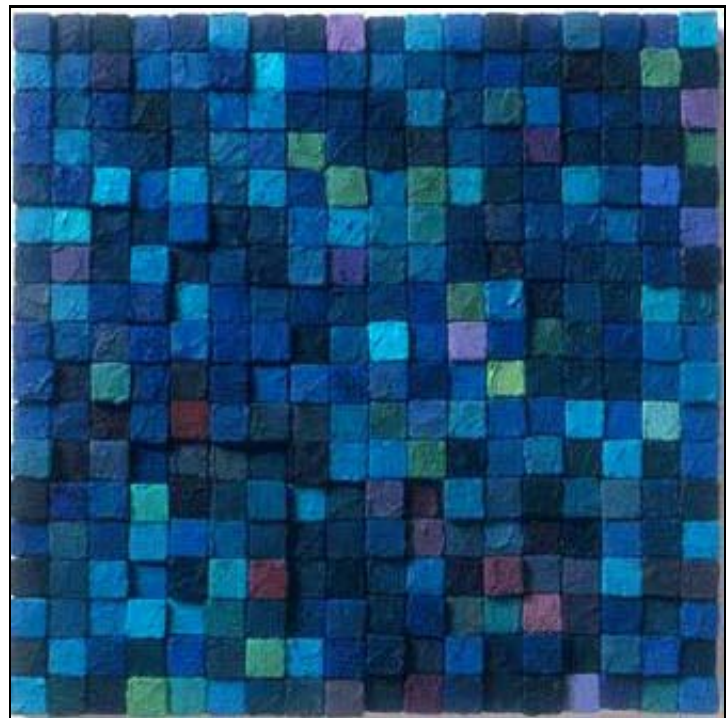
"Calixto," by Carlos Estrada-Vegas.

In the past, I found Estrada-Vega a bit stiff. But now, with various heights and color tones, his work takes on a nuanced mathematical vocabulary like music. A single note can be played a thousand ways.