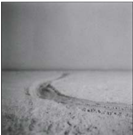
Fin and Dorosz's "Road," at Elizabeth Leach.

the Bay Area duo Amanda Fin and Inga Dorosz. Their photos of falsified arctic adventures are something I liked a lot. Custom frames, no mattes and milky glass all serve to heighten their sculptural effect.