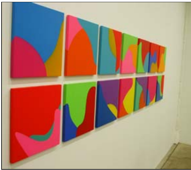
The "Desirable Objects, Palisades" series.

or at least looking. Surface acknowledges the viewer's role in the viewing equation.