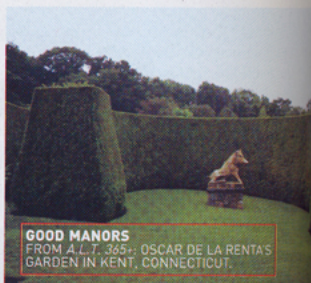
GOOD MANORS FROM A.L.T. 365+ : OSCAR DE LA RENTA'S GARDEN IN KENT, CONNECTICUT.

On the other end of the spectrum, there's the newly updated Miss Manners' Guide to Ex-