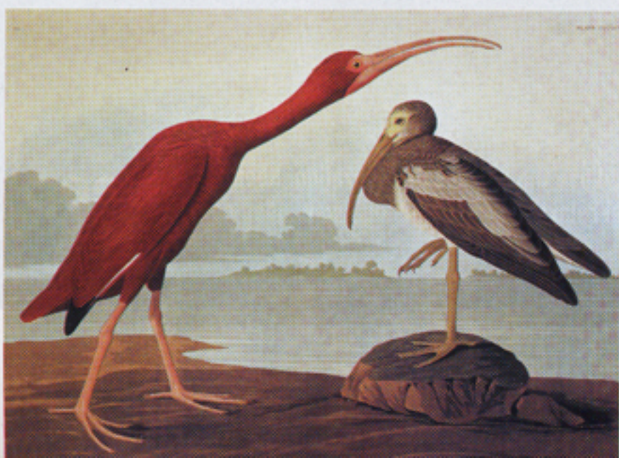
FLOCKING TOGETHER FROM BIRDS: THE ART OF ORNITHOLOGY : JOHN JAMES AUDUBON'S SCARLET IBIS (1837).