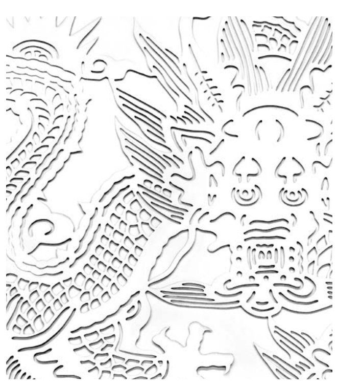
Fig. 5 Detail Vampire Academy • 2016 • Cut Paper • 37.5 x 61 in