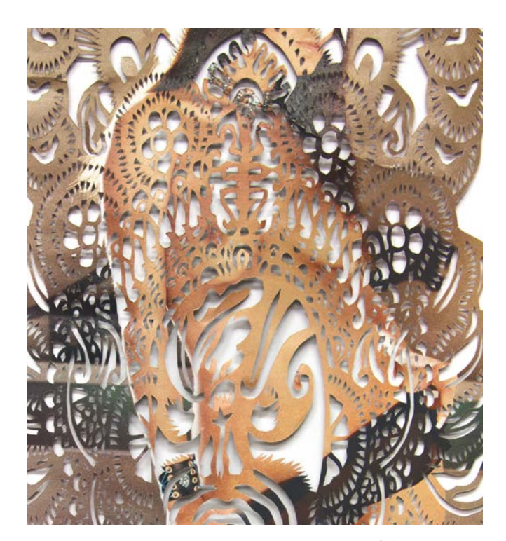
Fig. 7 Detail Warrior #2 • 2016 • Cut Magazine Centerfold • 21.5 x 10 in

the stamen and pistils of exotic blooms. The most modestly scaled of the recent groupings of work, "Bits and Pieces," consists of fully abstract collages assembled, as their name suggests, using fragments recycled from the making of the bigger pieces. Dense and compact, they serve as a kind of key or codex to the entire body of work, as well as a reminder that the heart of Brinker's endeavor is, in the broadest sense, a marriage of printed matter and glue.