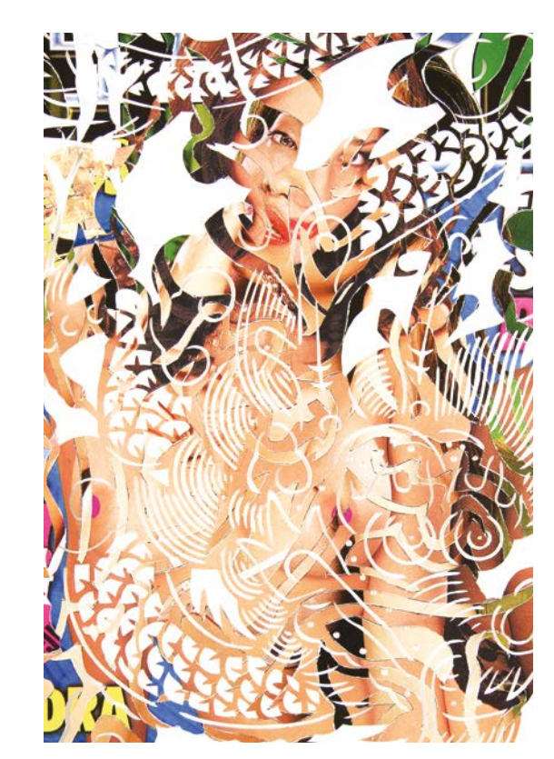
Fig. 1 Detail XXX Secret Dragon • 2016 • Cut Paper • 56 x 34 in

In XXX Secret Dragon (Fig.1), one of the standout larger pieces in his recent series, "Chasing Dragons," Brinker strives for a visual ambiguity that oscillates between the explicit and the oblique. Slivered glimpses of erotica, graphic novels, advertisement, and what appears to be circus posters drive both the viewer's curiosity and an accompanying urge to disentangle the visual complexity on hand, even after the brain's cognitive mechanisms have established that no amount of perceptual shuffling will boil the conglomeration down to a single, unwavering image, except the dragon. In the even more compositionally intricate Starlets Dragon (Fig.2), deliberate