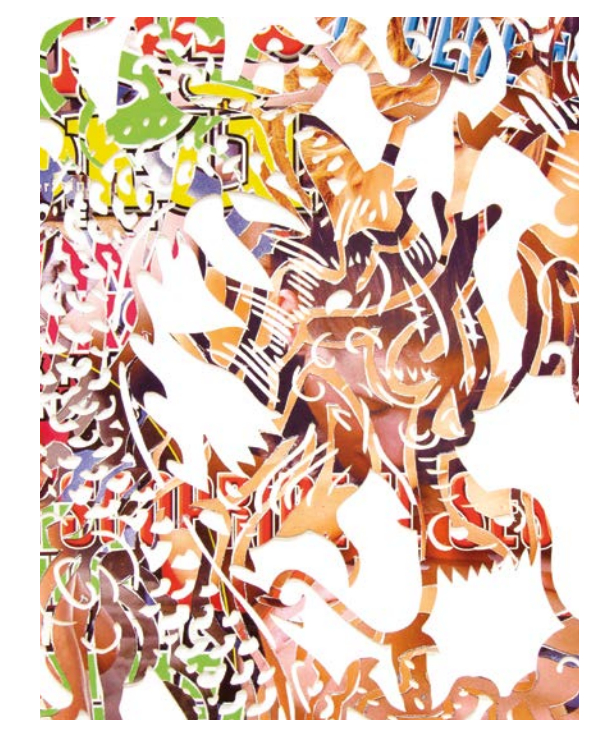
Fig. 2 Detail Starlets • 2016 • Cut Paper • 58 x 46 in