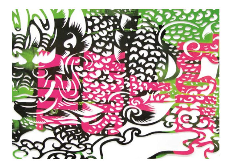
Fig. 3 Detail Vampire Academy • 2016 • Cut Paper • 37.5 x 61 in

incongruities in the legibility of the underlying forms are offset by the dramatic patterning achieved by the paper cuts, while the seeming instability of the outer contours is counter-balanced by the often startling depth of the interior spaces. Without ever explicitly committing to a predetermined subject matter for his work, Brinker succeeds in creating a fundamentally abstract object in which there is at least one, often two, and sometimes three separate degrees of imagery constantly weaving in and out of each other: the outer shape, the original collage source, and the 'modified' imagery that provides the warp and woof of the work's simulated textures.