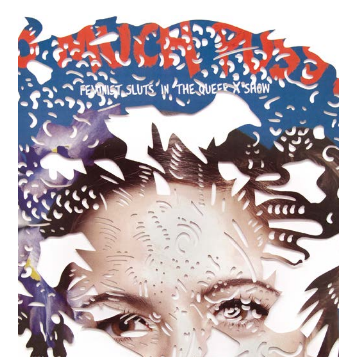
Fig. 4 Detail Vampire Academy • 2016 • Cut Paper • 37.5 x 61 in

Although his larger, multi-layered works constitute the more ambitious artistic statement overall, Brinker's dazzling manual facility with both media – the additive process of collage and the subtractive cut paper has also produced two series of medium scaled works that make use of less compositionally intricate cut-paper motifs – the warrior and the vase of flowers – to frame of more anatomically explicit images. With Kara Vase (Fig. 6), Brinker has situated a pair of female hips at the vase's broadest point, drawing on one of the oldest conventions of classic iconology: the doubled vessel, each conveying pleasure at its most temporal. In Warrior #2 (Fig. 7), the model in the underlying photograph uses her mouth, teeth and lips to simulate sexual ecstasy, which the scowling warrior outlined in the cuts seems to be voyeuristically appraising. An especially beguiling, if equally shopworn, overlay appears in still another centered on the layering of erotic imagery with the bursting outlines of budding flowers. Despite its well-worn theme, the latticework-like complexity of the botanical shape enables a more sustained focus on the underlying imagery, and its humid atmosphere of primary and secondary sex organs fused with