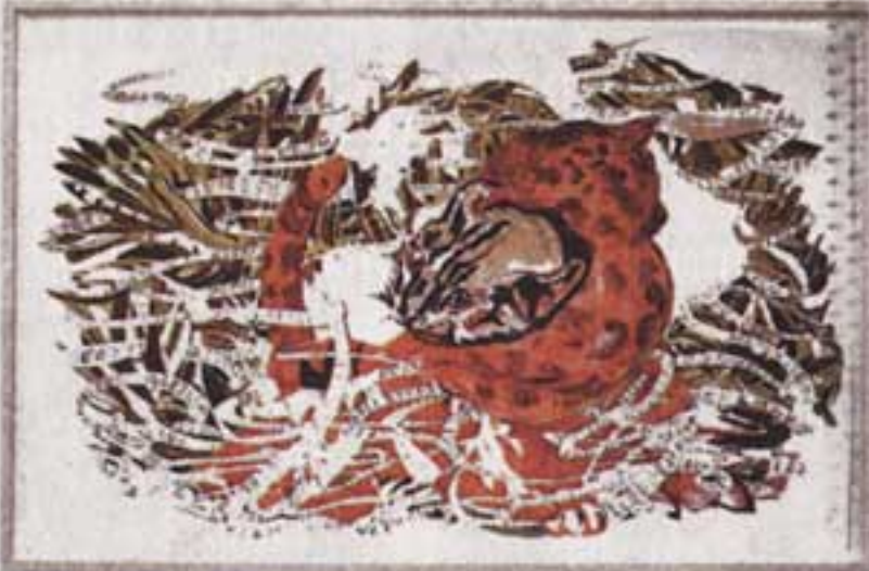
I WILL BE FERVENT, I'LL BE OBSERVANT