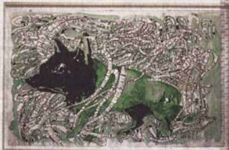
I WANT TO LIVE ON AN ABSTRACT PLANE