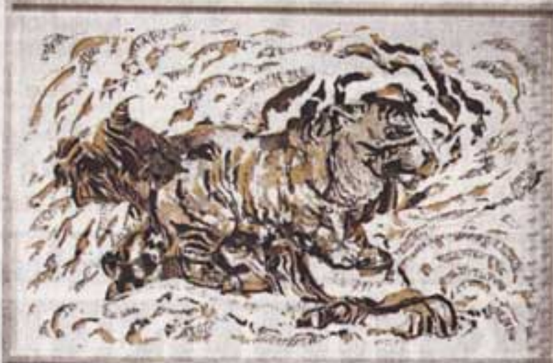
SEE IN MY FACE, I'LL TRAVEL THROUGH SPACE