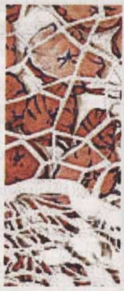
DREAMTIGER 4 (DETAIL)