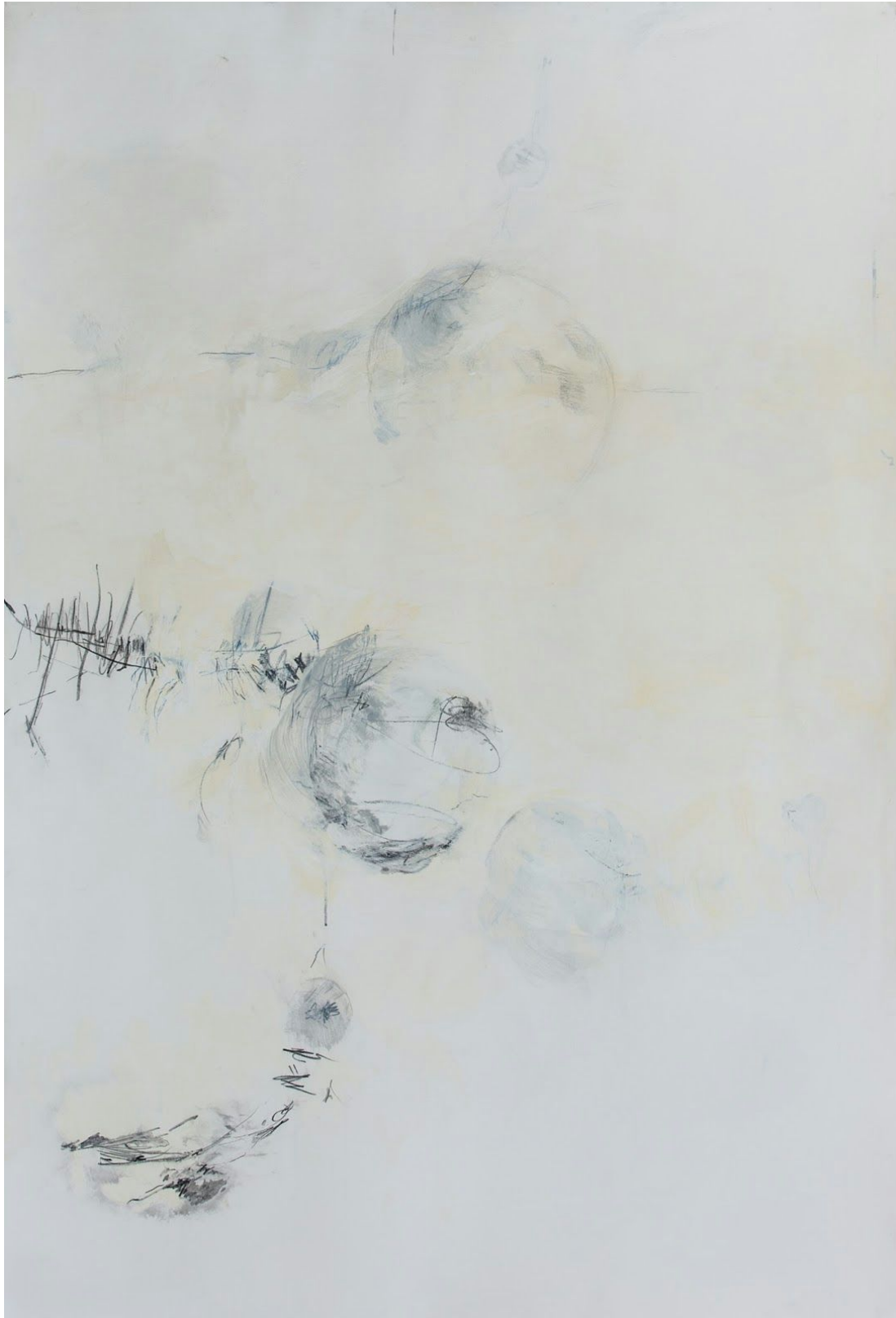
Teresa Waterman, Untitled, 2014, mixed media on paper 60x41"