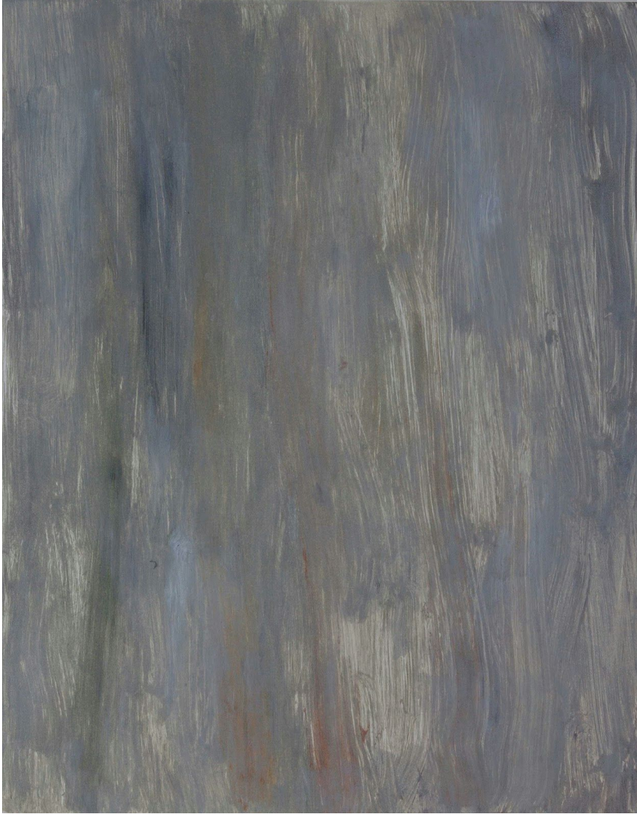
Lou Hicks, Grey Wall, 2014, montoye, 20x15.5, 30x22 (paper)

miranda arts project space 6 north pearl street, port chester, NY 10573 www.mirandaartsprojectspace.com mirandaartsprojectspace@gmail.com 914.318.7178