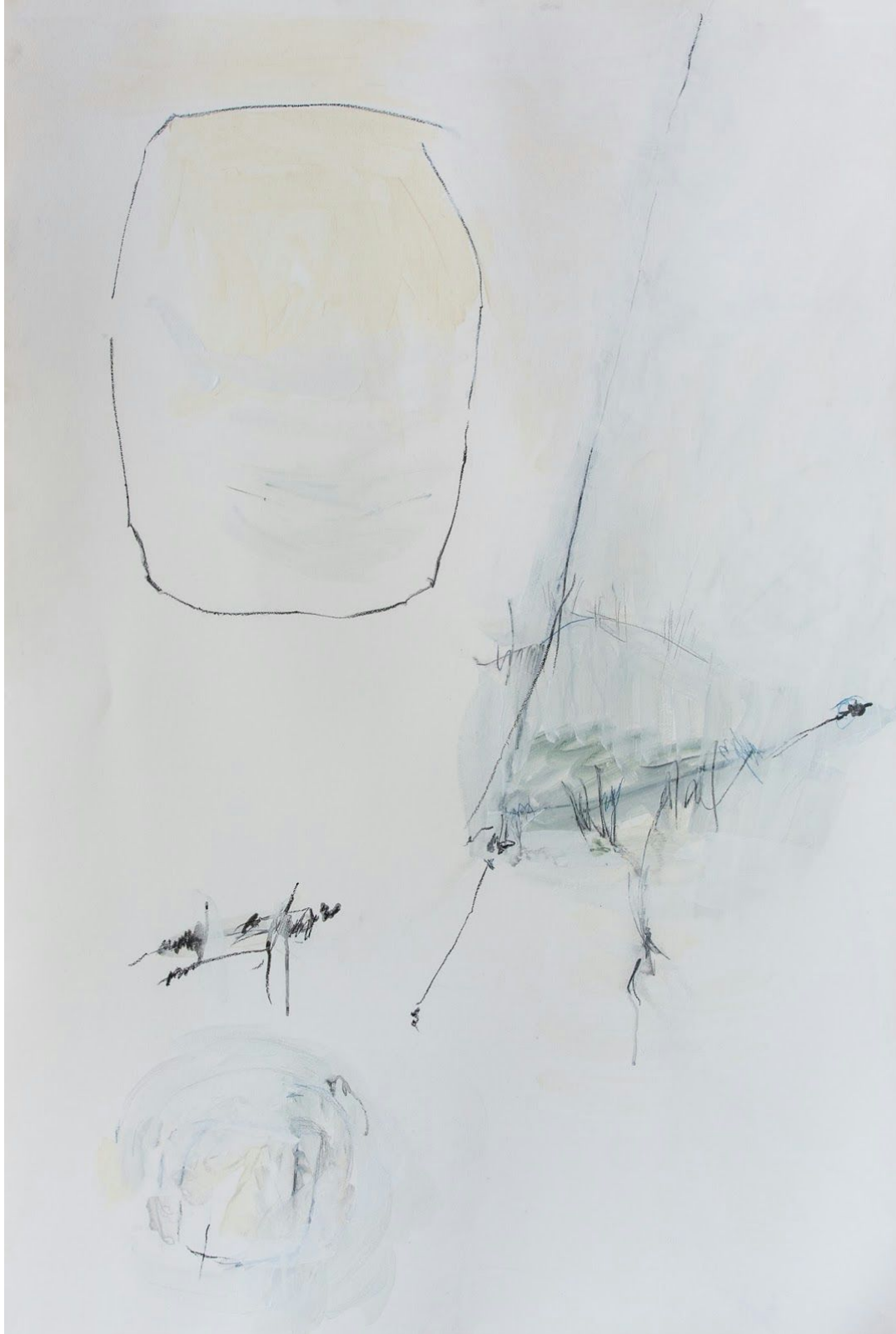
Teresa Waterman, Untitled, 2014, mixed media on paper 60x41"

miranda arts project space 6 north pearl street, port chester, NY 10573 www.mirandaartsprojectspace.com mirandaartsprojectspace@gmail.com 914.318.7178