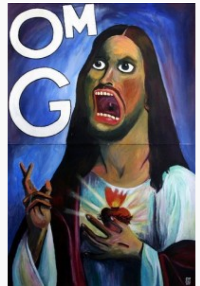
Ernest Concepcion, OMG Christ II (2011) acrylic on paper.

In addition to curating the show, Lombardi contributes to the conversation by including a selection of his Urchin sculptures. Reminiscent of baby dolls, the sculpted sand, childlike bodies are composed of found objects from the seashore that make up parts of these creatures' bodies and personalities.