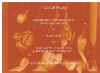
Booth, 'Untitled, 2008.' Photo: Original image: Juan Sánchez Cotán, Still Life with Game Fowl (1600/1603), courtesy of the Art Institute of Chicago.

"Still life with a decapitated head, a liquid called 'pear' and a small book no larger than a fingernail," recites a smooth male voice, which emerges from the speakers lining the Hyde Park Art Center's 1,800-square-foot Gallery 4.