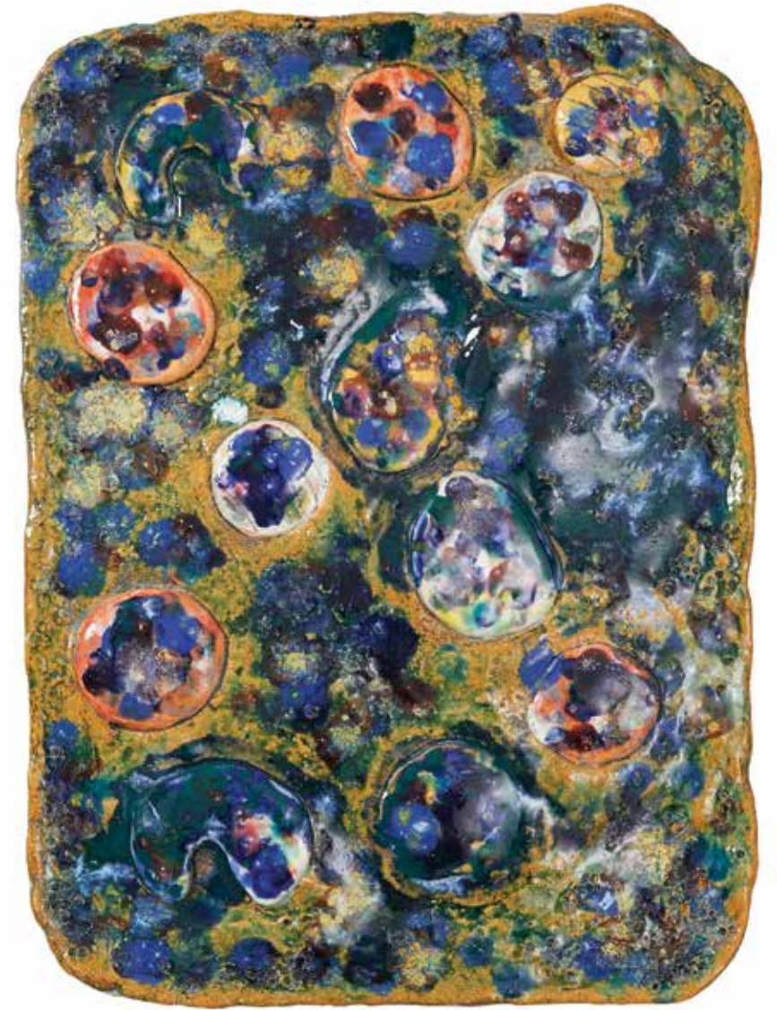
Opposite: Gathering Vessel , 2017, glazed ceramic 11" x 15" x 5"

Painting, sculpture and ceramics have different laws of logic. To merge the three may be impossible, but I'm excited to see what comes of my attempts. I started off as a painter, however after I had a child, I started working at Greenwich House Pottery during their nighttime open studio hours. I turned to ceramics because of the immediacy of the working process and because ceramics capture a sense of the talismanic in the ordinary. The sculptures document my inquiry to preserve the essence of my subjects, both figurative and abstract, as well as to chronicle a frozen history of gestural mark-making. I symbolically transfigure the subject through an accumulation of modeled layers of clay and embedded ceramic.