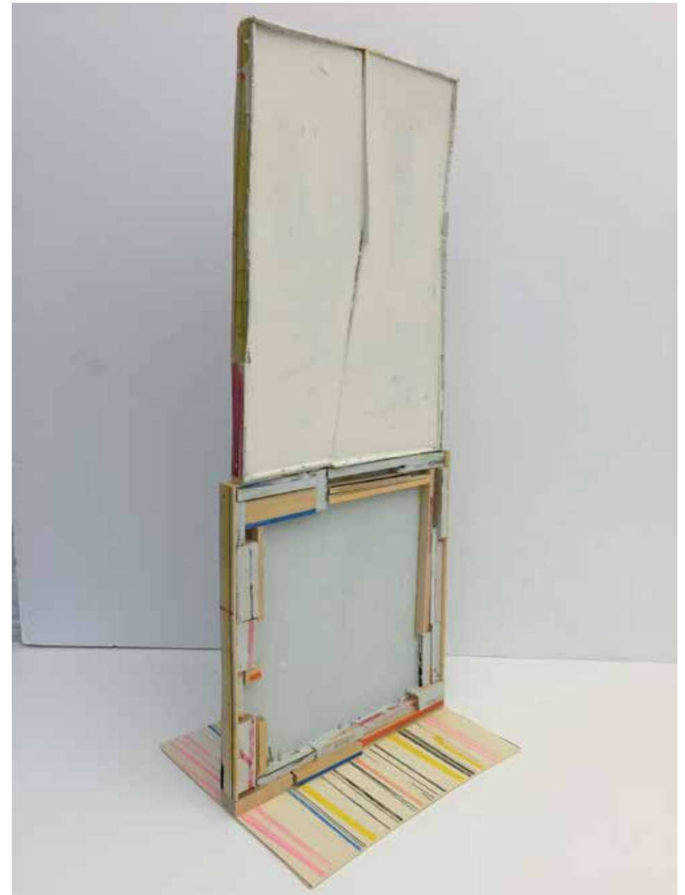
Opposite: Untitled (True Story) , 2017, paper, mixed media collage, dimensions variable

Working in different materials, especially clay, has meant that I need two places to work; this can be liberating, when I feel stuck in a moment of frustration with painting or collage I can change studios and get my hands muddy with clay. I have always constructed my paintings—building them out of wood, cutting them apart, gluing them and putting them back together, layering them with chalk gesso, pencil and marker. My drawings are also constructed—layers of magazine pages are roughly glued together—torn and drawn-on, cut and manipulated, stepped on and tossed on the floor. The ceramic sculptures are very crudely put together—piled up earthy clay forms become messy body-like vessels with arms overhead. The common thread in all these works is my desire to physically manipulate material with my hands—hugging, touching, squeezing, making a new self.