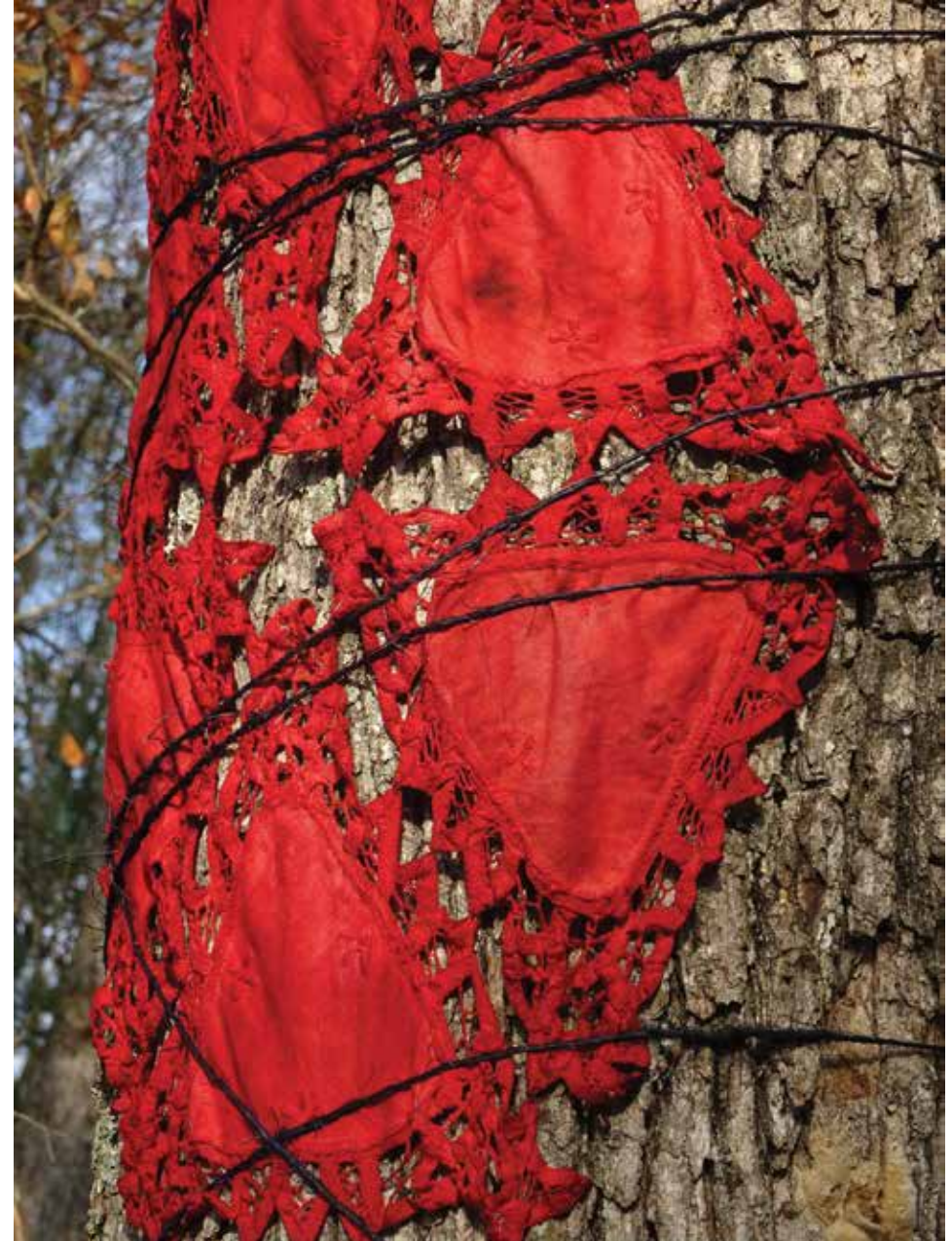
Opposite: Relinquere , 2012, plaster, graphite, rabbit skin glue, variable dimensions

My studio work draws from the grammar, syntax, and history, of materiality using natural dyes and pigments, textiles, deconstructed books, and installation. Through the language of objects, I explore an inchoate sense of mourning, fear, and desire, for the untamed feminine as feared other, and how this prescribes our encounters with one another, our history, and the plant and animal world. Each material speaks its language and chemistry, from its beginning as plant, flower, clay, insect, to its shaping by human culture. Science relocates this as a knowing through touch, in the intimate process of transforming a material from raw to artwork. Each holds and brings an autonomous history and stands as witness; the physical becomes voice in color, texture, sound, context. From wasp nests, mineral pigments, plaster, and the multiplicity of the book form, to a physical space open for collaboration, I engage with the tangible world as collaborator in a diverse art-making, meaning-making process.