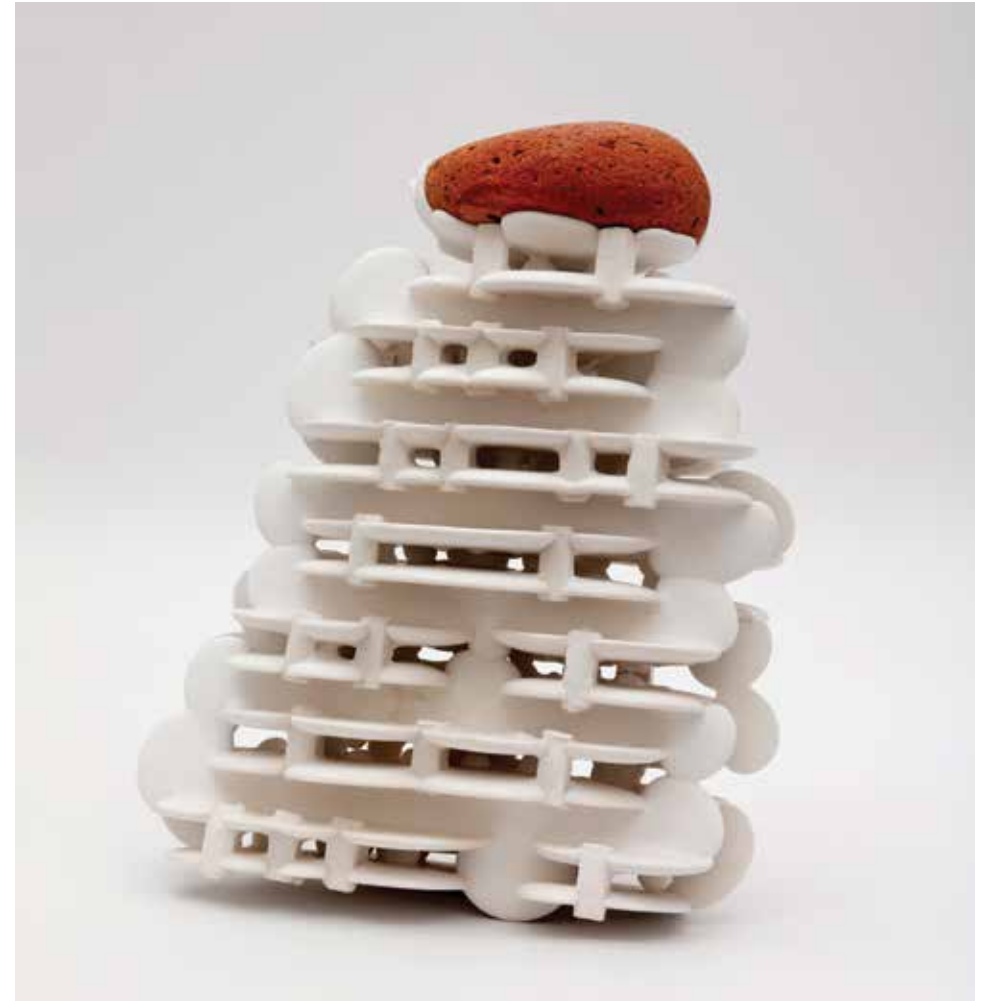
Opposite: Rock , 2017, archival pigment print, 34.25" x 43.5"

An object isolated from its environment—where it constitutes the world's debris—brings attention to its unique and mysterious properties and to the processes behind its formation. I go out into nature and pick up a rock with holes, for example, and realize it has been bored into by an anemone. I'm still fascinated by the moment of revelation, and by the way in which it's so concretely and perfectly expressed as a form. My sculptures—into which these objects may at some point be integrated—operate in a similar way. In the recent, large photographs that document the objects I've collected I'm thinking about monumentality and the heroic.