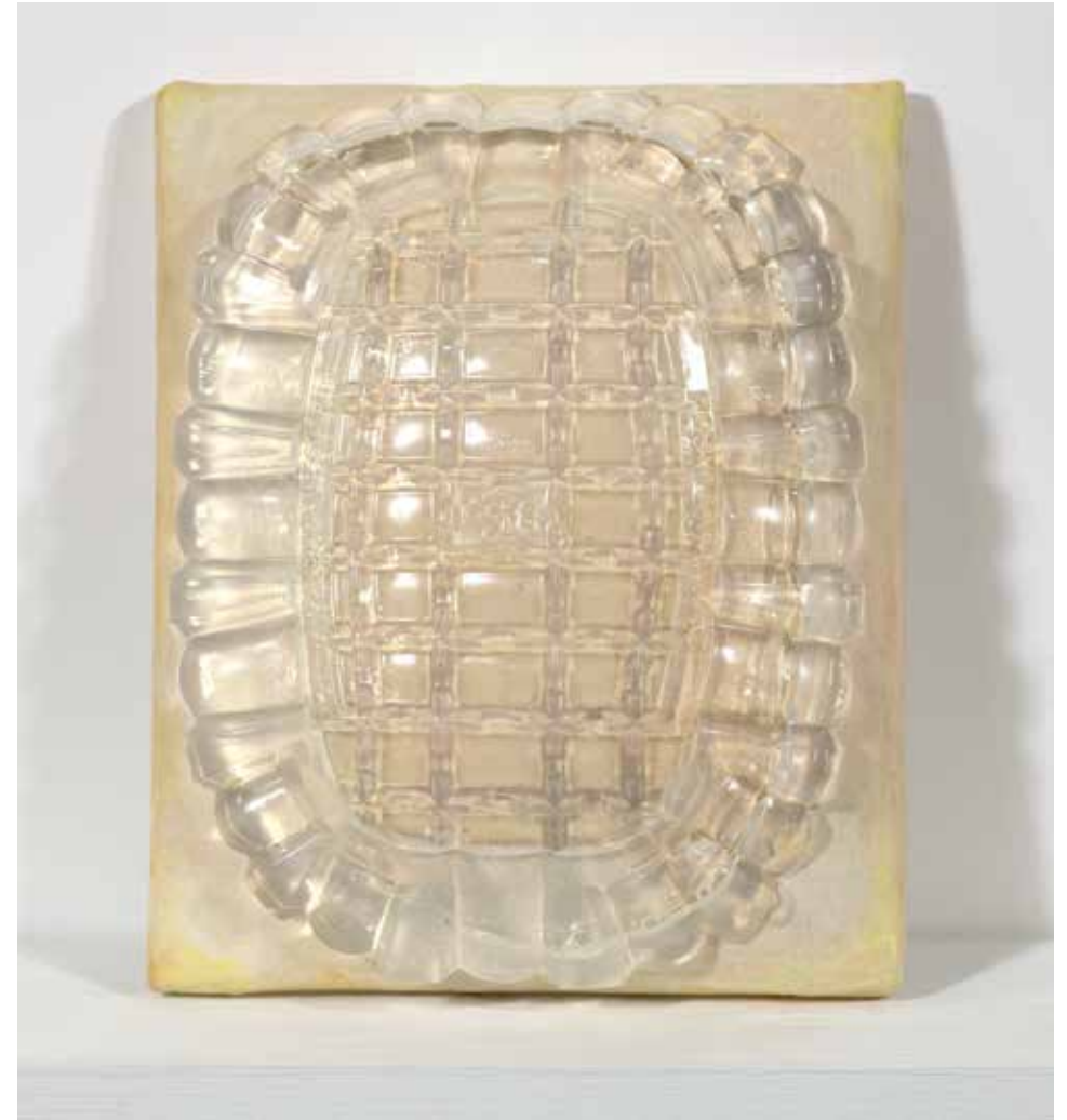
Opposite: Whole Foods , 2017, wood, acrylic skins, acrylic paint, plastic, fabric, variable height x 48" x 3.5"

Working with different media creates opportunities to make something new and unexpected. I like using paint and traditional artist supplies, but by adding found objects and untraditional materials to the work, with their different surfaces, dimensions, former uses, qualities, and histories, I give myself more options for expression. I work on many pieces simultaneously. I collect all kinds of stuff and like to have it around me in the studio. When I see disparate things together, especially when they accidentally touch each other, it can spark a fresh idea. This way of working is an important part of my studio practice.