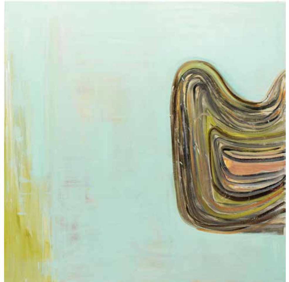
Opposite: Lost , 2017, oil paint and found ceramic 3”x 4”

In recent years, I've expanded my studio practice to include digital photography, prints, drawings and small sculptures. One year, on a whim, I gathered piles of desiccated leaves from my yard and began photographing them, then piles of flea-market tchotchkes, and then piles of used paint scraped off my palette. The paint grew into huge cascading slumps that I stuffed inside assorted broken knick-knacks; their grim beauty seemed transformative and full of potential meaning. I felt energized by the possibility of seeing and making something that wasn't a painting. There is an excitement in working with these objects—the off-kilter-ness, strangeness and surprise of them break the deadly spell of “painting”. Expanding my studio practice to include different media has been a way to breathe new life into my work—with one thing bouncing off the other.