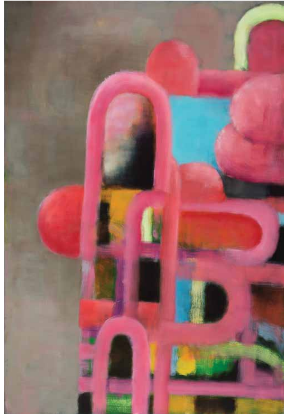
Opposite: Salmon Steak , 2015, pastel on paint chip, 3" x 4"

Painting is a battlefield. I'm building, erasing, doubting, looking, ruining, thrilling. It is physically and mentally challenging. It is the best and the worst thing in the world. To offset this intensity, I turn to the food drawings. They are tiny, they are easy and they are delightful to make and to see. There's no mess. I need this balance in the studio to keep sane and keep going. I tend to work 80% on the paintings and 20% on the pastels. I do the food drawing as if I'm on a quick break. I started the food drawings as gifts to give to friends and family. I would think of a food that someone liked and created a drawing. Then I just enjoyed it so much I kept going. Now with its Instagram account, I'm committed to post every Friday a food drawing for #foodfriday, so I will keep on. Food is endless, just like painting.