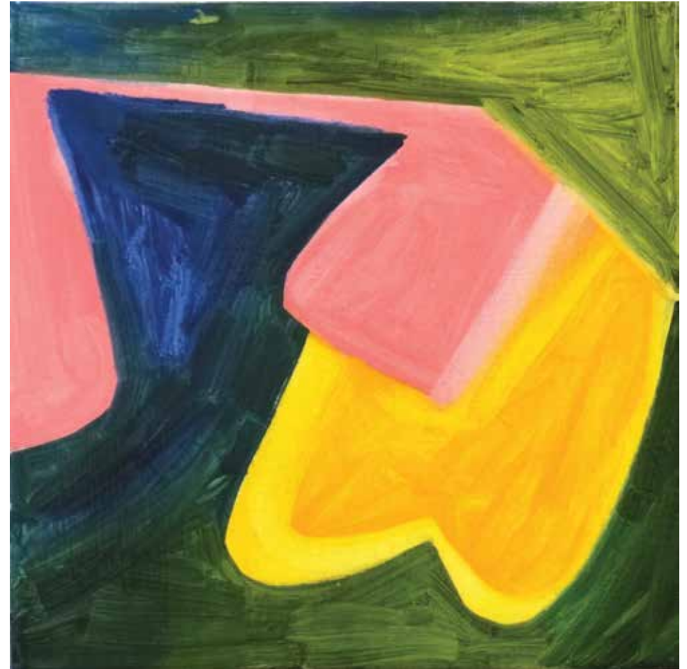
Opposite: Unit 3 , 2017, acrylic paint on plywood, 13" x 16"

I think of paint as a communicator that translates my ideas, my environment and history. My sense of abstract is a way to combine form with color to launch an idea. My history is an important part of this vehicle. The places I've lived, the people I've known, the airplanes that I've flown, where I've traveled all continue to be active pieces of this narrative. I'm a great believer in the use of different materials to convey ideas. I can easily move between studio supplies using what seems best. This often includes several different materials within a work day. In the past these materials supported my two-dimensional work. The idea of working with wood began several years ago with a series of shaped wall hanging that eventually led to "free standing" units or sculptures. They are closely related to my paintings and have given me a third dimension to utilize. It seemed a natural progression to incorporate an additional surface. I often paint daily on wood and canvas. It has become a practice that strengthens both disciplines and one that I continue to use.