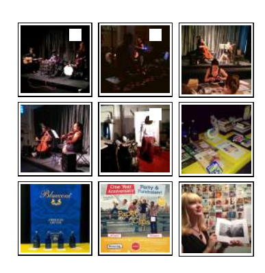
Powered by ICONOSQUARE