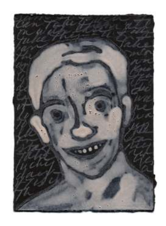
From top to bottom - Finalist #6, 47, 99 gesso, acrylic, tar gel and graphite on paper 3.5 x 2.5 in 2005/06