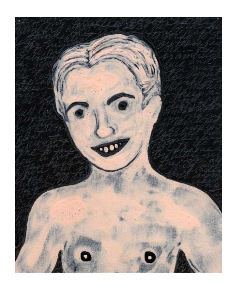
Finalist #4263 gesso, acrylic, tar gel and graphite on paper9.75 x 7.75 in 2005/06