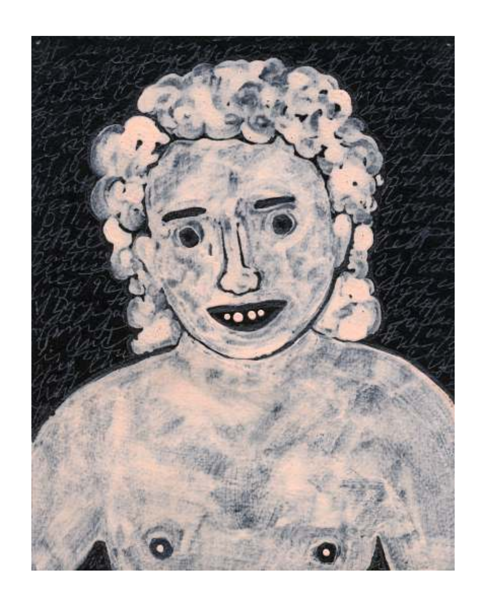
Finalist #691 gesso, acrylic, tar gel and graphite on paper9.75 x 7.75 in 2005/06