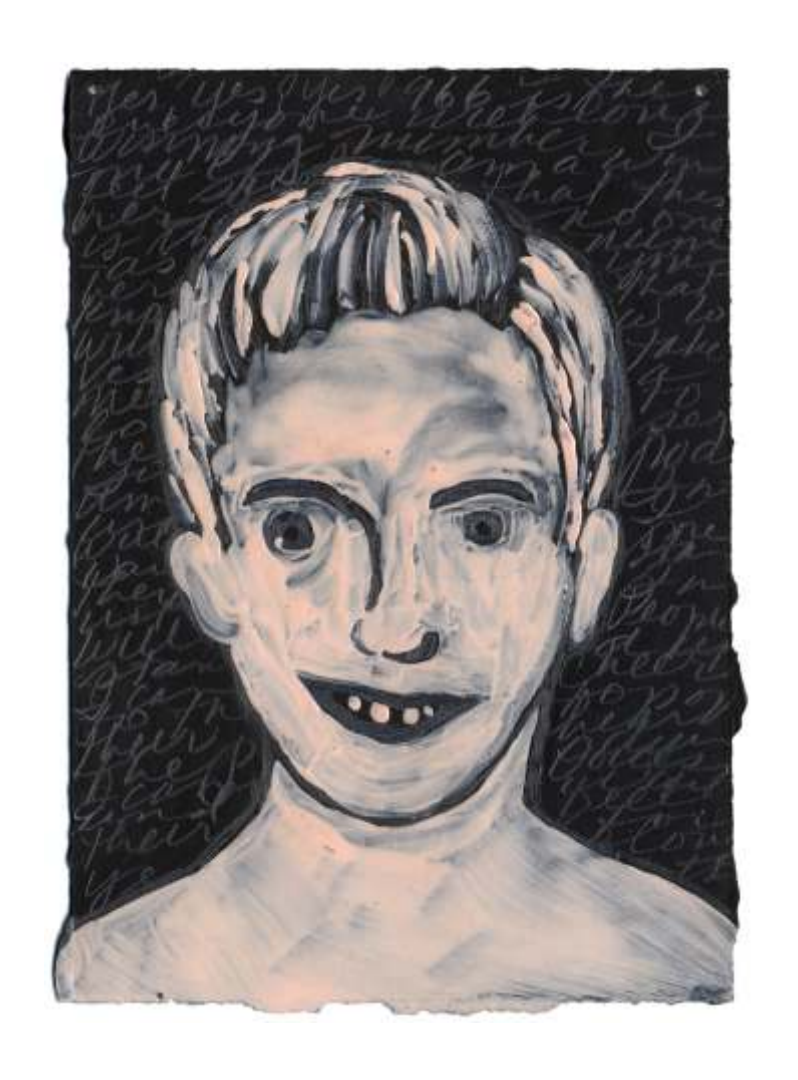
Finalist #966 gesso, acrylic, tar gel and graphite on paper 7 x 5 in 2005/06