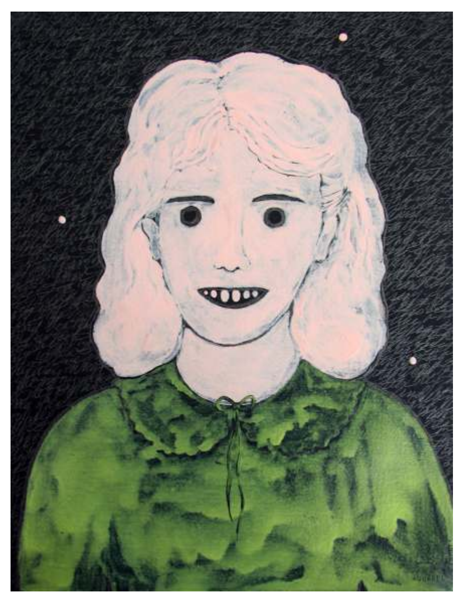
Finalist #63 gesso, acrylic, tar gel and graphite on paper19 x 15 in 2005/06