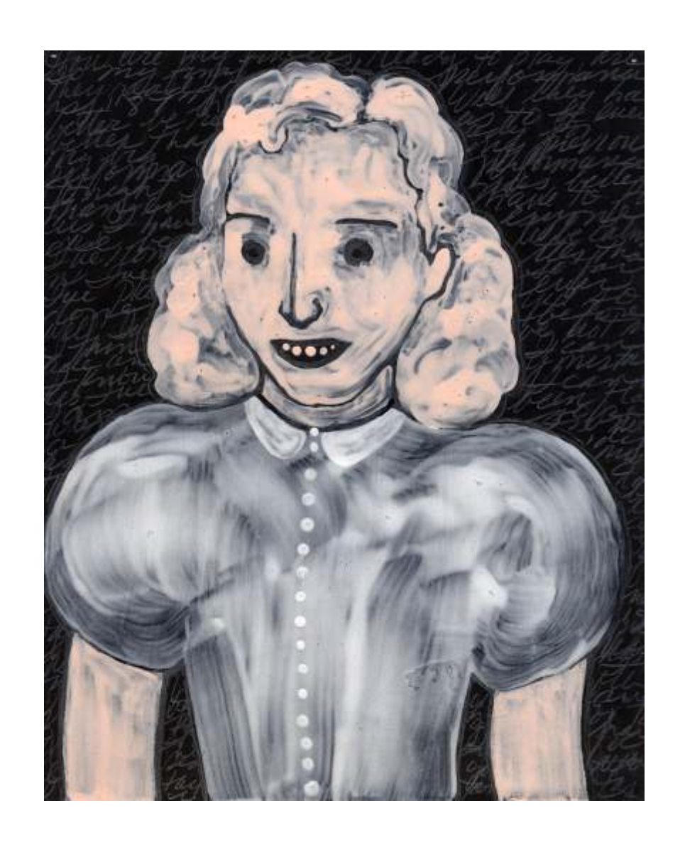
Finalist #87 gesso, acrylic, tar gel and graphite on paper9.75 x 7.75 in 2005/06