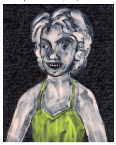
Judith Page Results of the Headhunt April 22 - May 23, 2006

Contemporary Drawings and Works on Paper