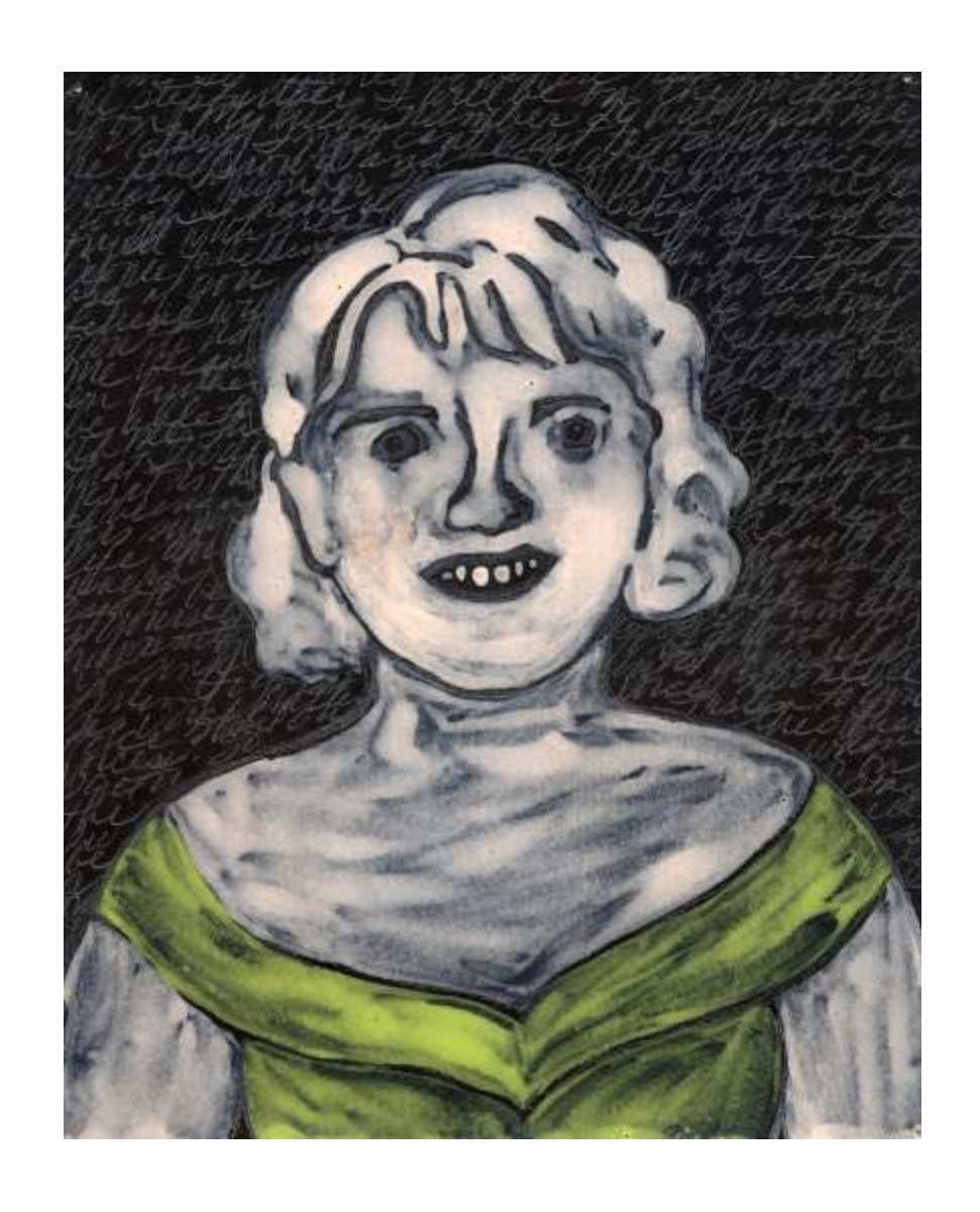
Finalist #20 gesso, acrylic, tar gel and graphite on paper9.75 x 7.75 in 2005/06