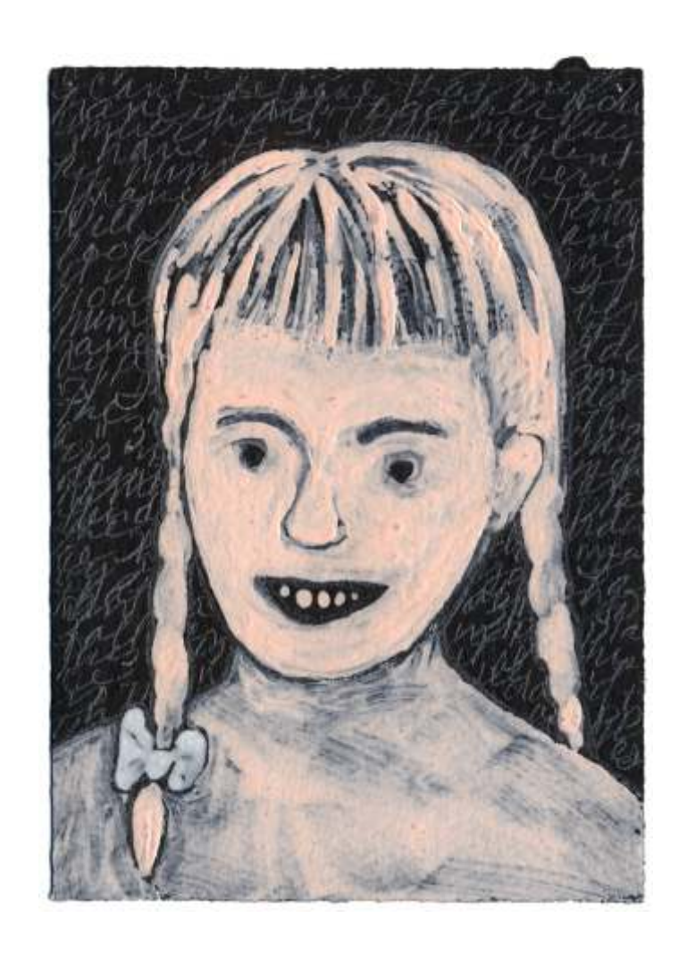
Finalist #3 gesso, acrylic, tar gel and graphite on paper 7 x 5 in 2005/06