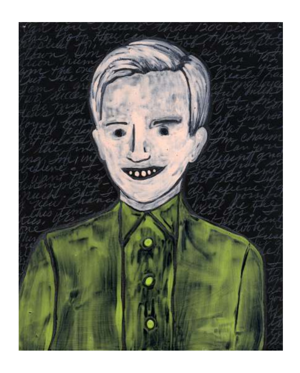
Finalist #722 gesso, acrylic, tar gel and graphite on paper9.75 x 7.75 in 2005/06