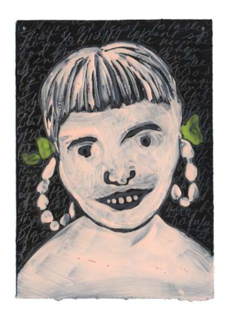
Finalist #67124 gesso, acrylic, tar gel and graphite on paper 7 x 5 in 2005/06