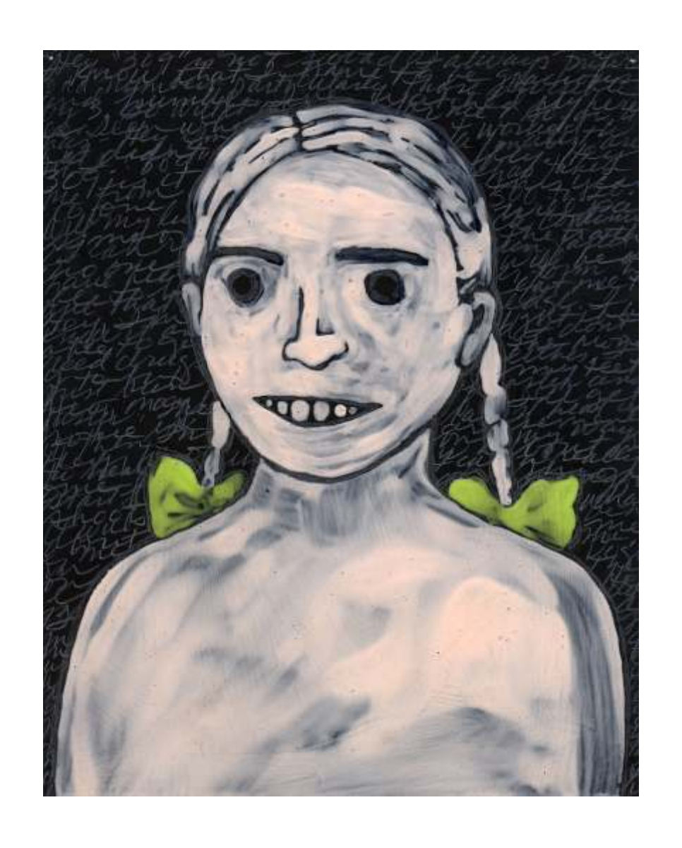
Finalist #309 gesso, acrylic, tar gel and graphite on paper9.75 x 7.75 in 2005/06