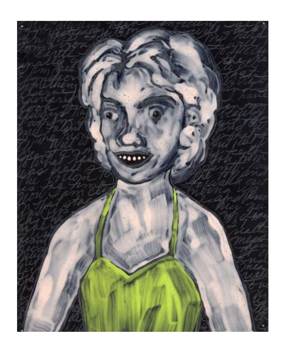
Finalist #25 gesso, acrylic, tar gel and graphite on paper9.75 x 7.75 in 2005/06