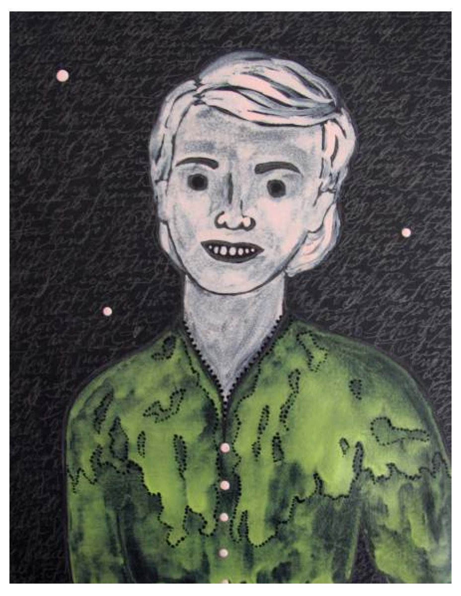
Finalist #123 gesso, acrylic, tar gel and graphite on paper19 x 15 in 2005/06