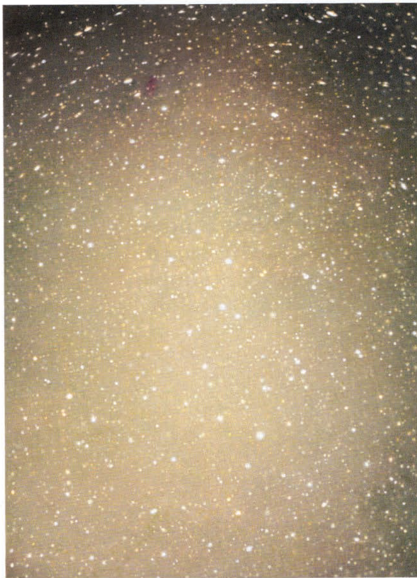
Vija Celmins: Untitled (Ochre) , 2016, oil on canvas, 18 by 13½ inches.

'70s views across rooftops to New York from an earlier home in New Jersey). The parallel form of the screen or clear window dissolves into the picture plane itself. There is an off-kilter, often geometric monumentality to these compositions, hinting at another order that may provide a consolation in the face of the dissolution she documents: a close-up of Harry's face on the driveway, a dug-up pile of turf, the snake in the grass. Murphy's calculated correspondences seem momentary, almost instantaneous, but are sunk into time and emerging out of it through the painting process.