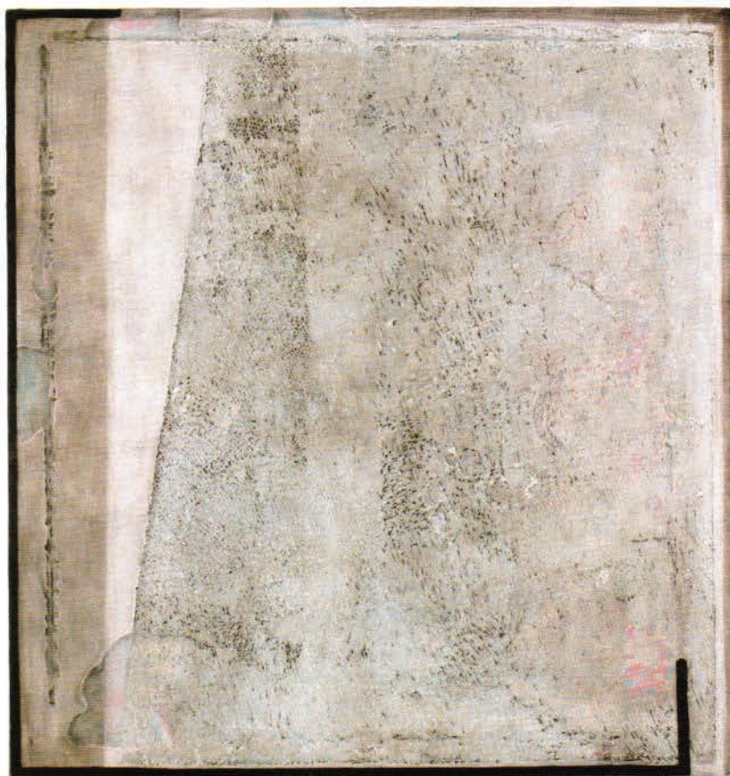
Dickinson: Knows , 2013–15, oil on limestone polymer on panel, 56¼ by 53¾ inches.

preoccupied with setting the stage for time unfolding slowly in the viewer's perception. Their work takes time to make and the time it takes conditions how we view it.