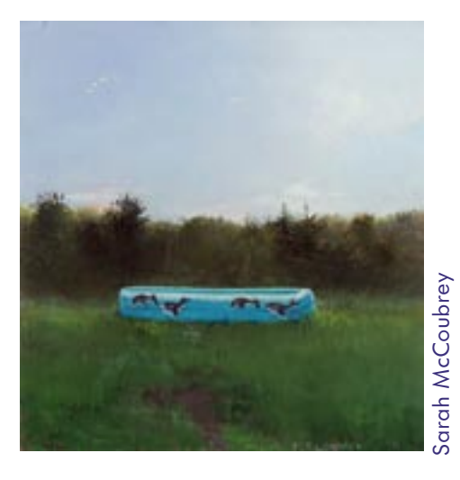
"Global Suburbia: Mediations on the World of the 'Burbs"