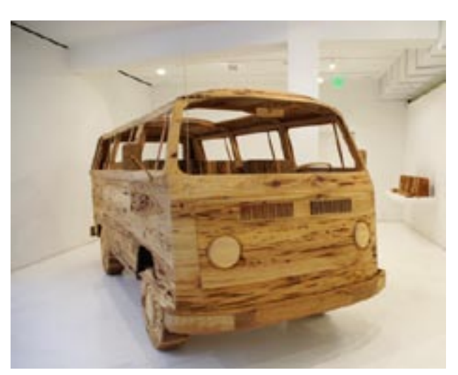
Lee Stoetzel, VW Bus, 2007.

camping hippies performing counter-cultural rituals. Introduced in 1950, the VW Van became synonymous with the growth of the suburb, paving the way for the suburban fleet: station wagons, Suburban vans, minivans and eventually SUVs.