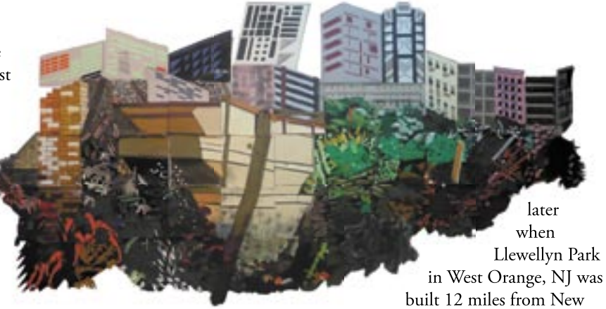
Eva Struble, 22@ Development, 2008.

Jenkintown is a town in its own right (settled in 1697 and incorporated in 1874), yet city slickers often mistakenly view it as just another Philadelphia bedroom community, even though it is far denser than typical sub-divisions. Generally speaking, suburbs are residential communities that crop up around cities to accommodate city workers looking for cheaper living spaces, newer amenities, personal safety, and quality public schools. Victoria Park, the first ever suburb, began as a gated community outside Manchester, England. The first U.S. suburb came 20 years