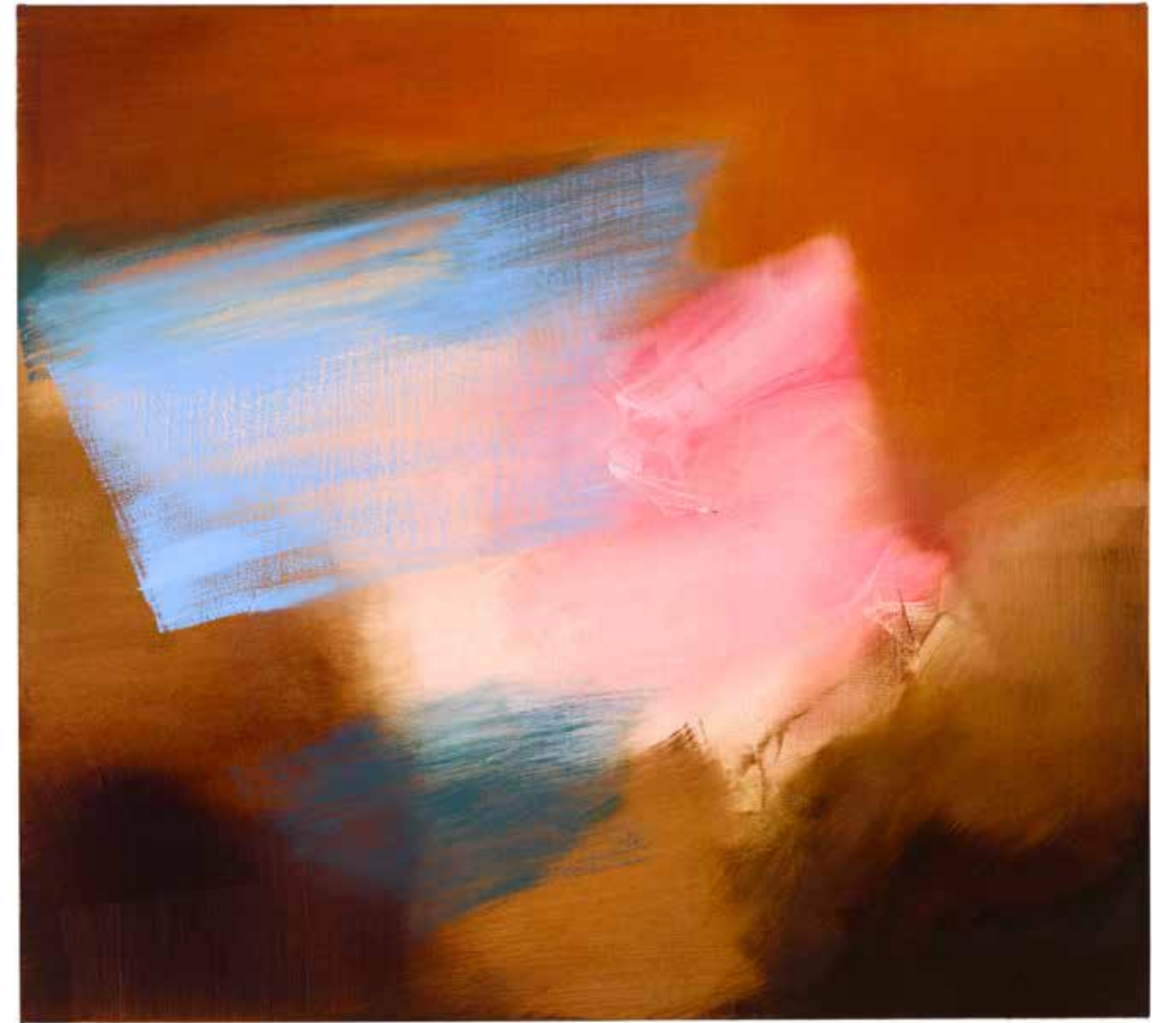
Mythology , 2022 oil on linen, 27 x 30 in.