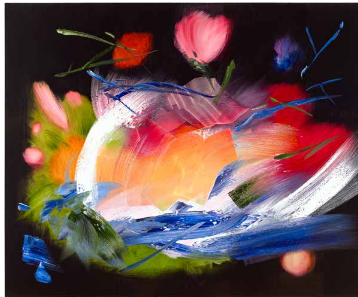
Sunrise 2022 oil on linen, 33 x 44 in.