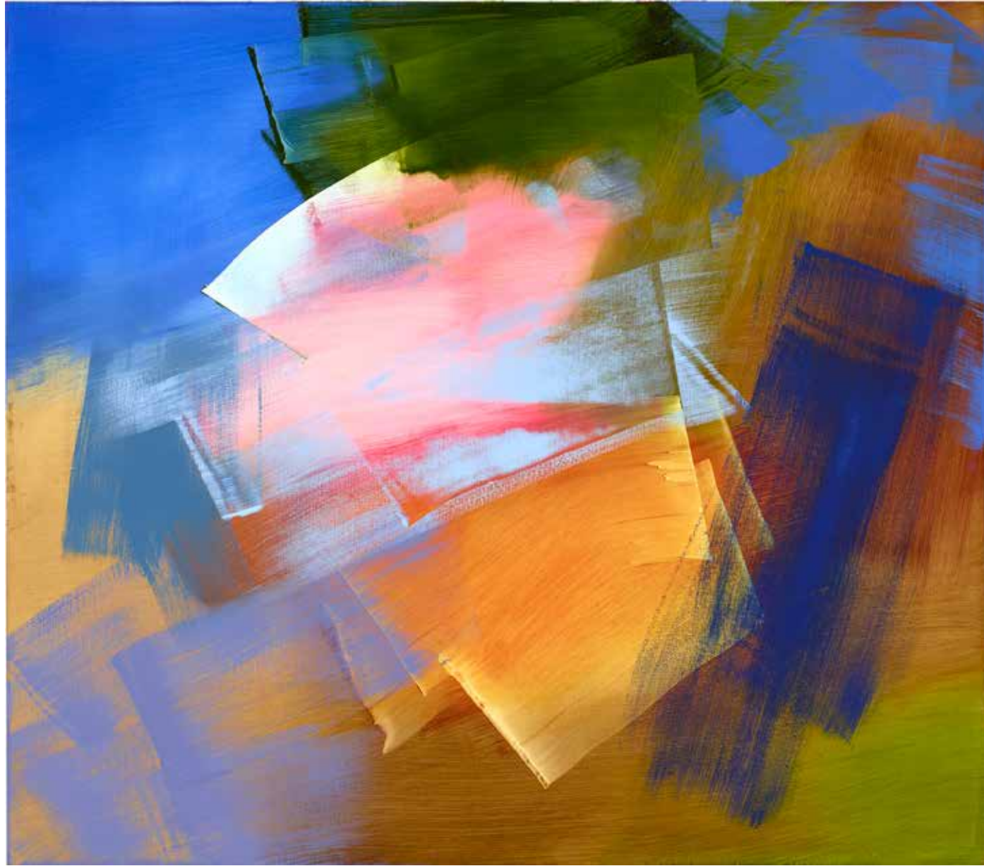
Ariadne IV , 2022 oil on linen, 44 x 50 in.