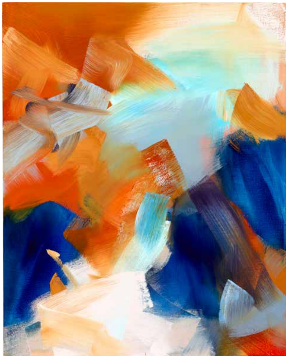
Esther III , 2022 oil on linen, 30 x 24 in.