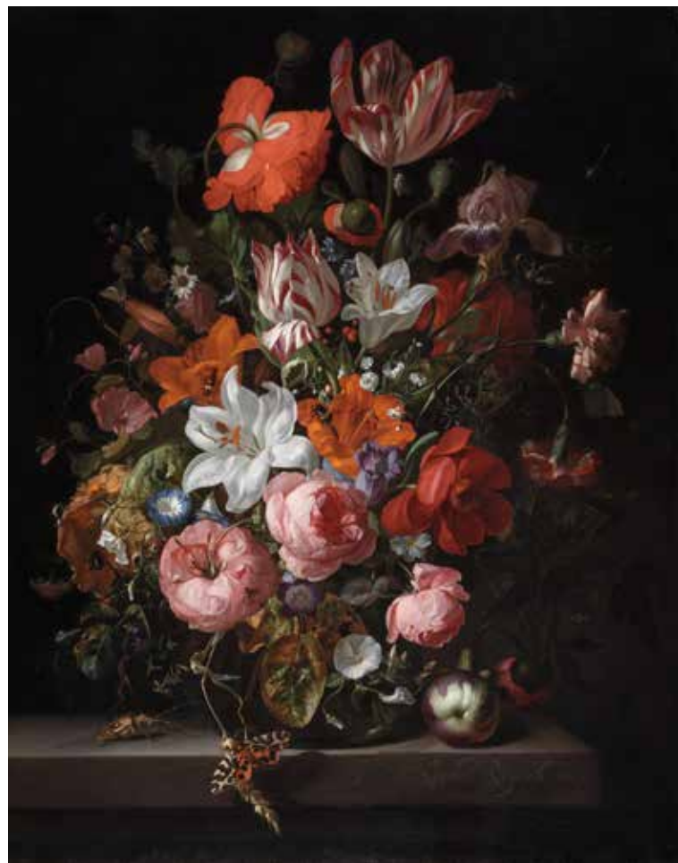
Rachel Ruysch Flowers in a Glass Vase , 1704, oil on canvas, 33 x 26.25 in. Collection: Detroit Institute of Arts, Detroit, MI