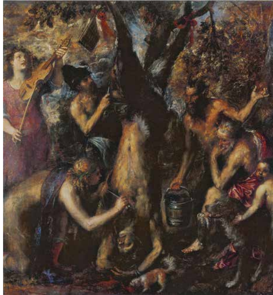
Titian Flaying of Marsyas , c.1570-76, oil on canvas, 83 × 81.5 in Collection: Archdiocesan Museum Kroměříž, Archbishopric Castle Kroměříž, Germany