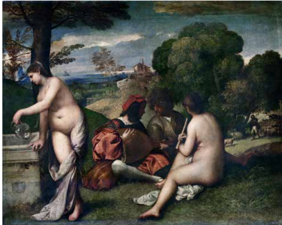
Titian The Pastoral Concert or Le Concert Champêtre , c.1509, oil on canvas, 41.325 x 53.75 in. Collection: Musée de Louvre, Paris