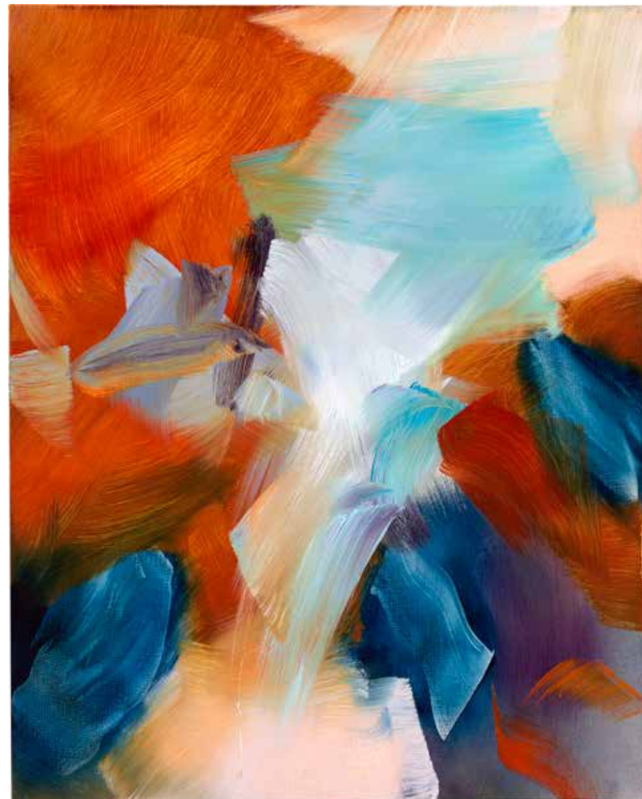
Esther V , 2022 oil on linen, 30 x 24 in.