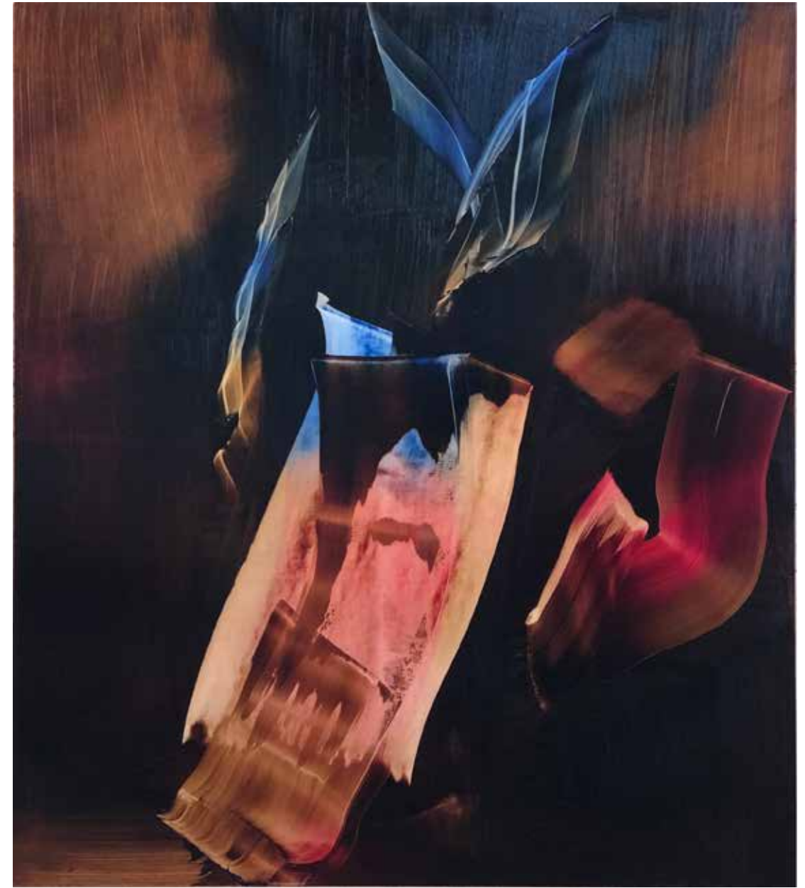
Obsidian Butterfly I , 2022 oil on linen, 50 x 44 in.