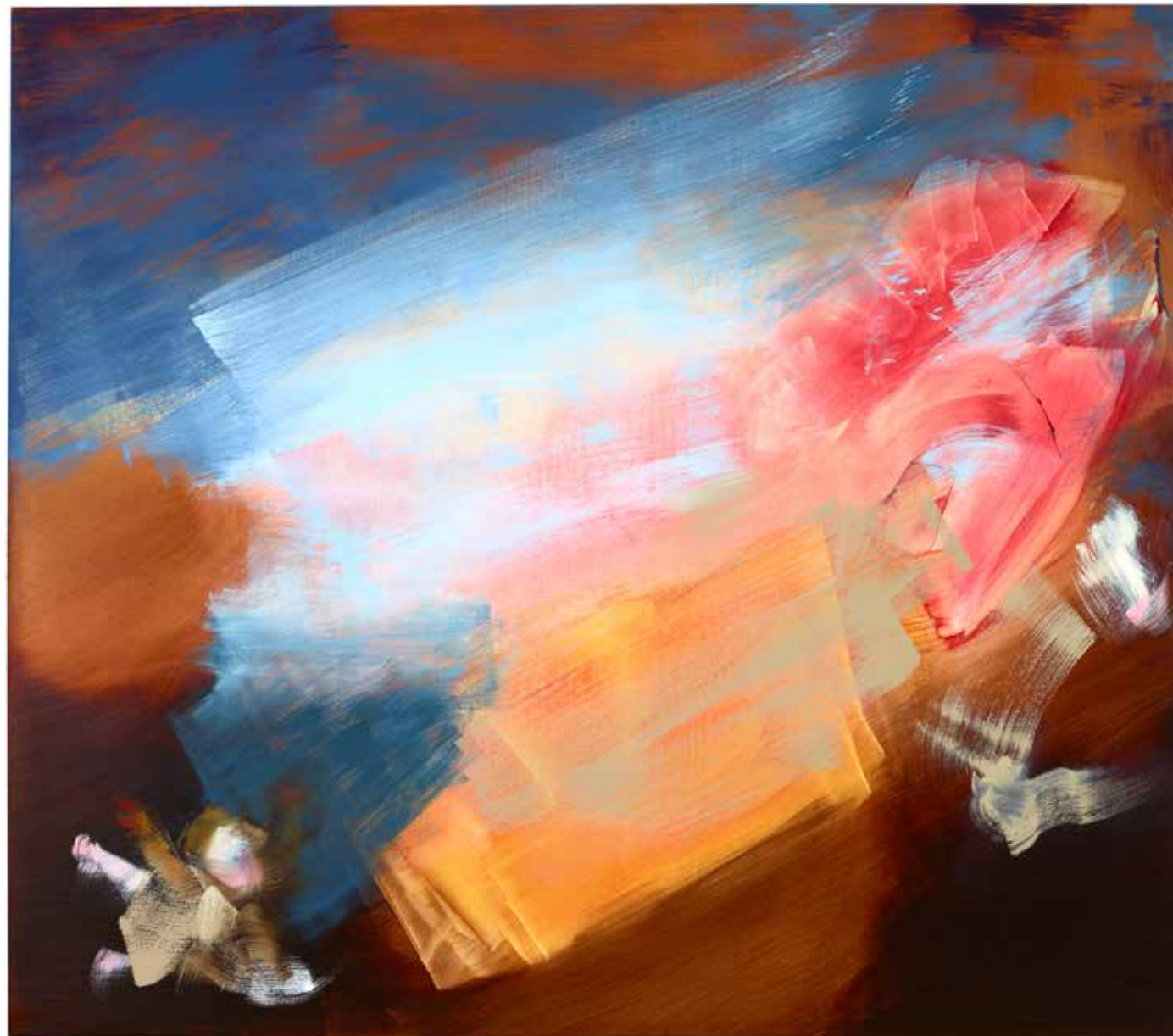
Rosy Fingered Dawn , 2022 oil on linen, 44 x 50 in.