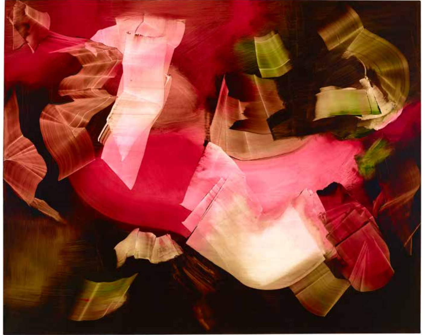
Sardanapalus IV , 2022 oil on linen, 48 x 60 in.