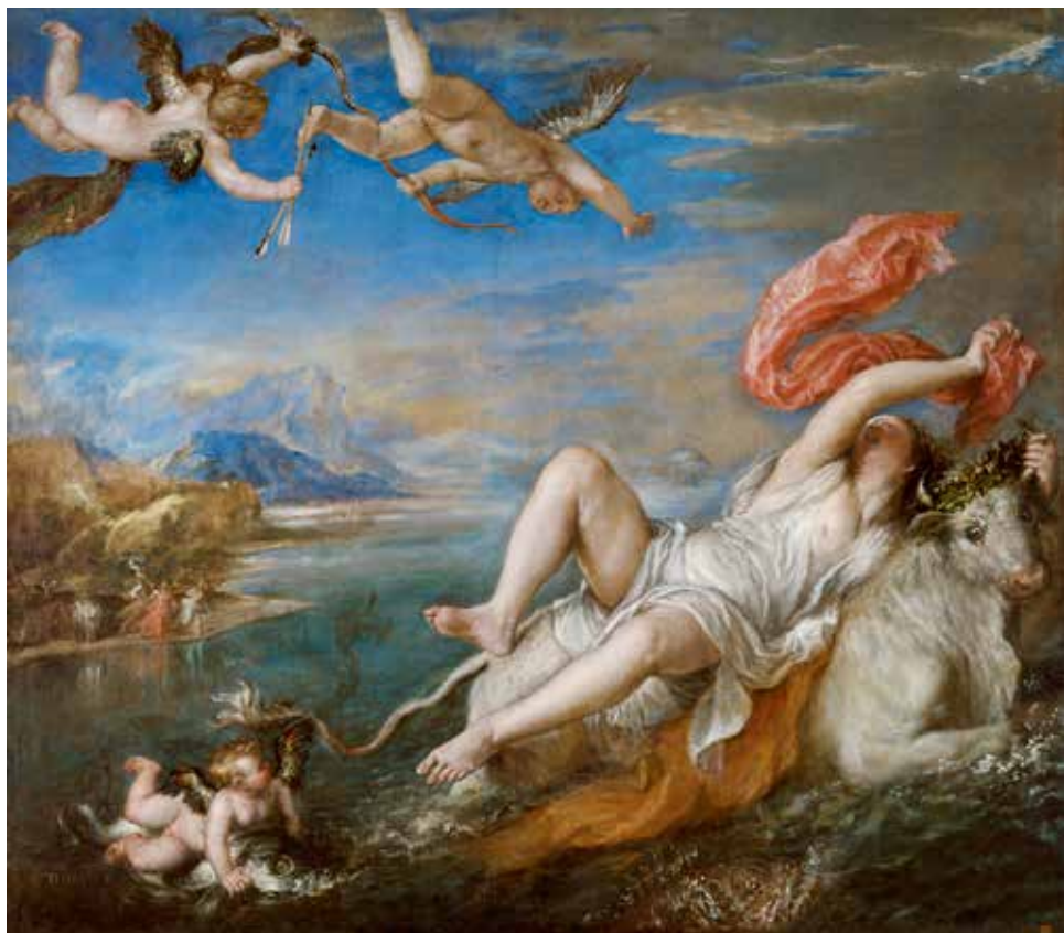
Titian The Rape of Europa , 1559-1562, oil on canvas, 70 x 81 inches Collection Isabella Stewart Gardner Museum, Boston, MA