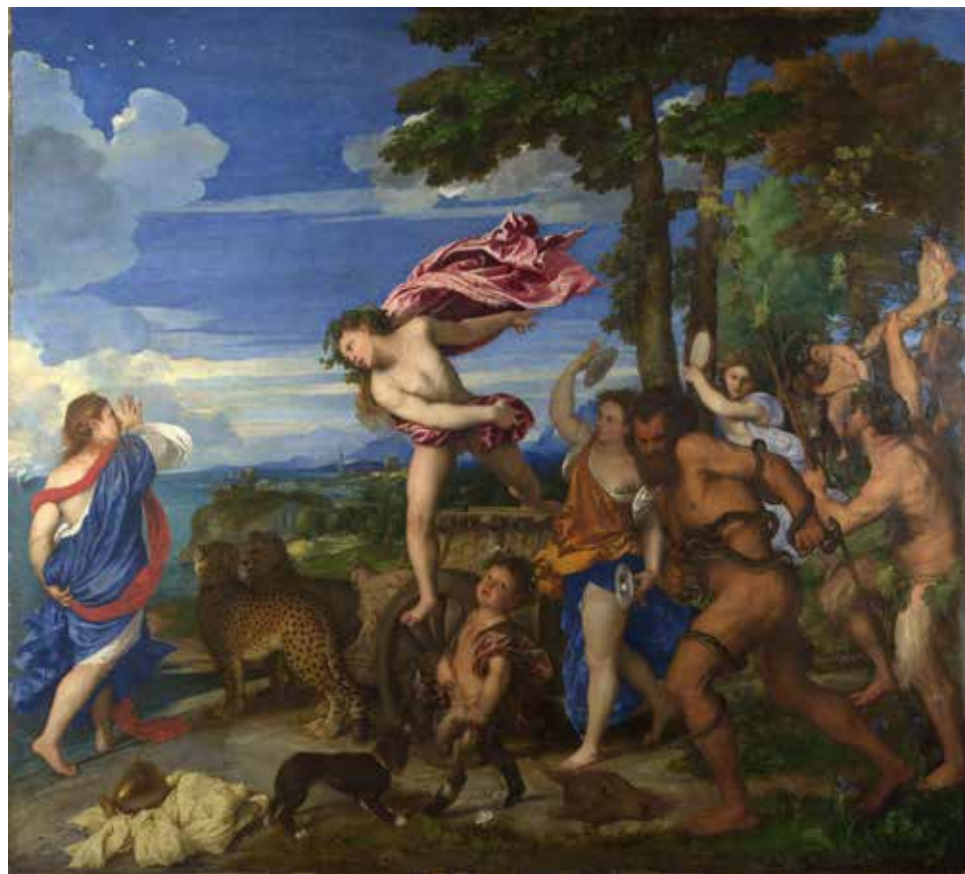
Titian Bacchus and Ariadne , 1522-23, oil on canvas, 60.5 x 75 in. Collection National Gallery of Art, London