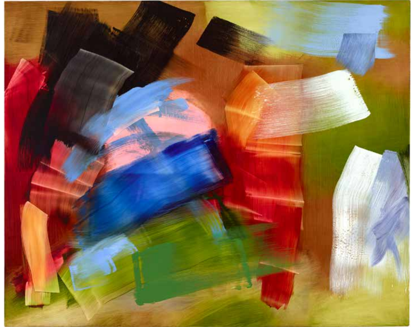
Fire Fangled Feathers IV , 2022 oil on linen, 48 x 60 in.