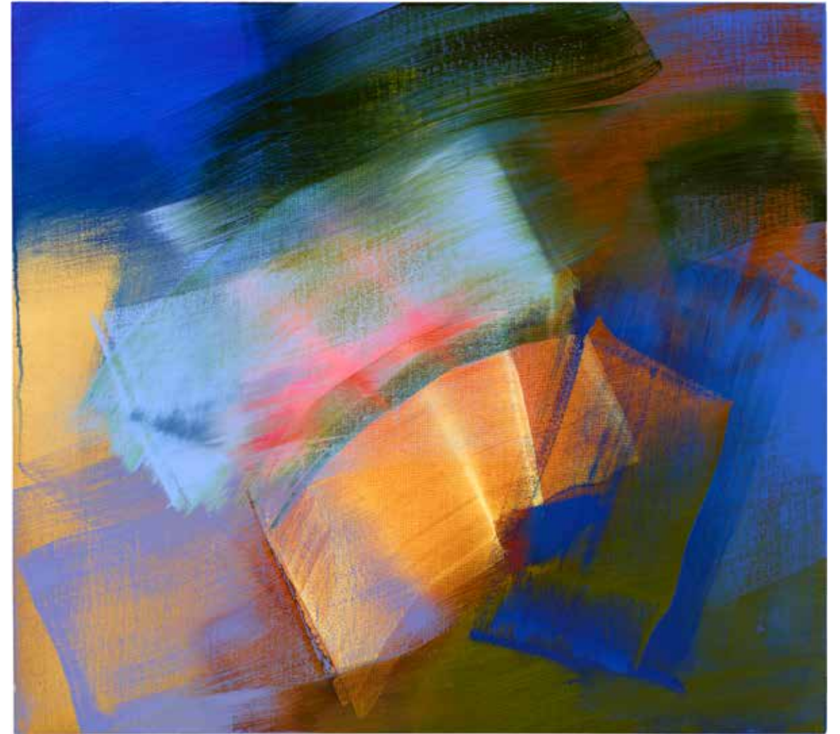
Ariadne III , 2022 oil on linen, 27 x 30 in.