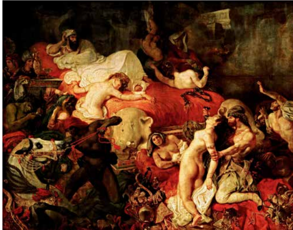
Eugène Delacroix The Death of Sardanapalus , 1827, oil on canvas, 154 x 195 inches Collection Musée du Louvre, Paris, France