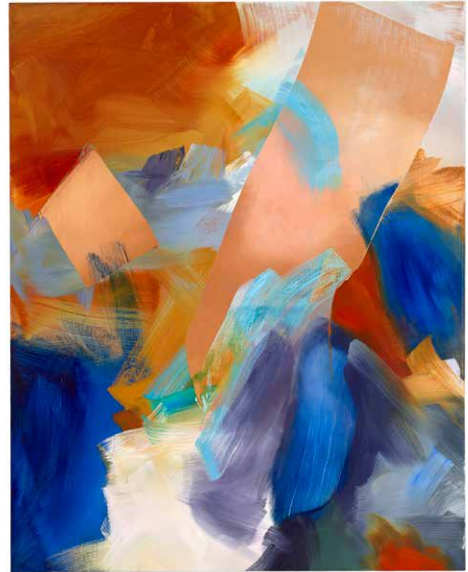
Esther IV , 2022 oil on linen, 40 x 32 in.