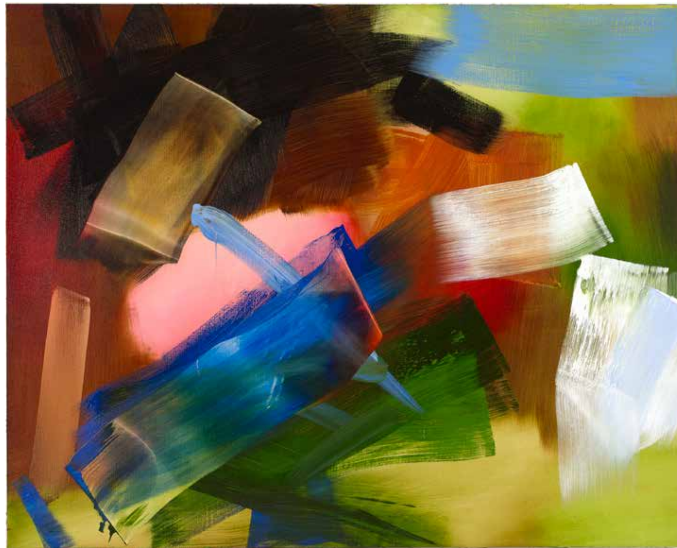
Fire Fangled Feathers I , 2022 oil on linen, 48 x 60 in.