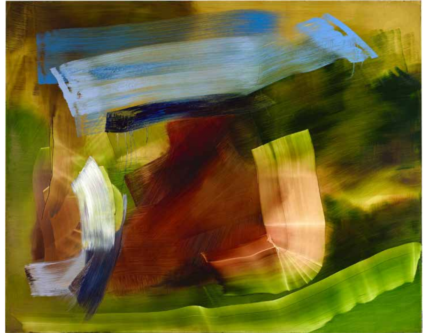
Pastoral II , 2022 oil on linen, 48 x 60 in.