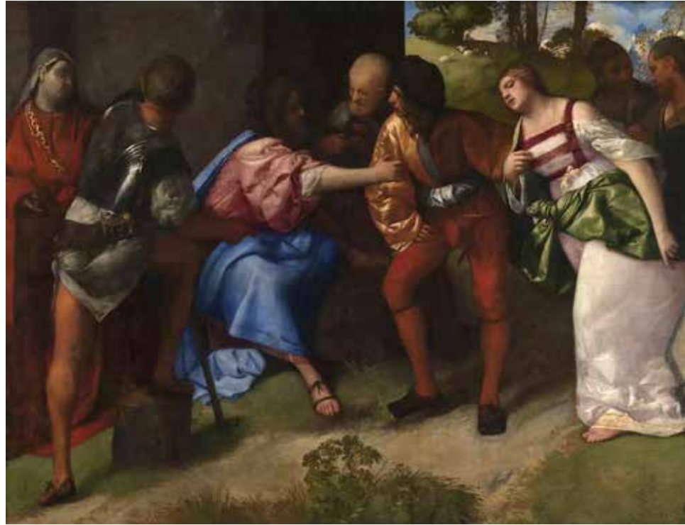
Titian Christ and the Adulteress 1508-10, oil on canvas, 55 x 71.5 in Collection: Kelvingrove Art Gallery and Museum, Glasgow