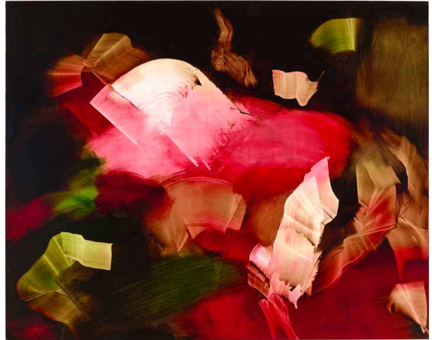
Sardanapalus III , 2022 oil on linen, 48 x 60 in.