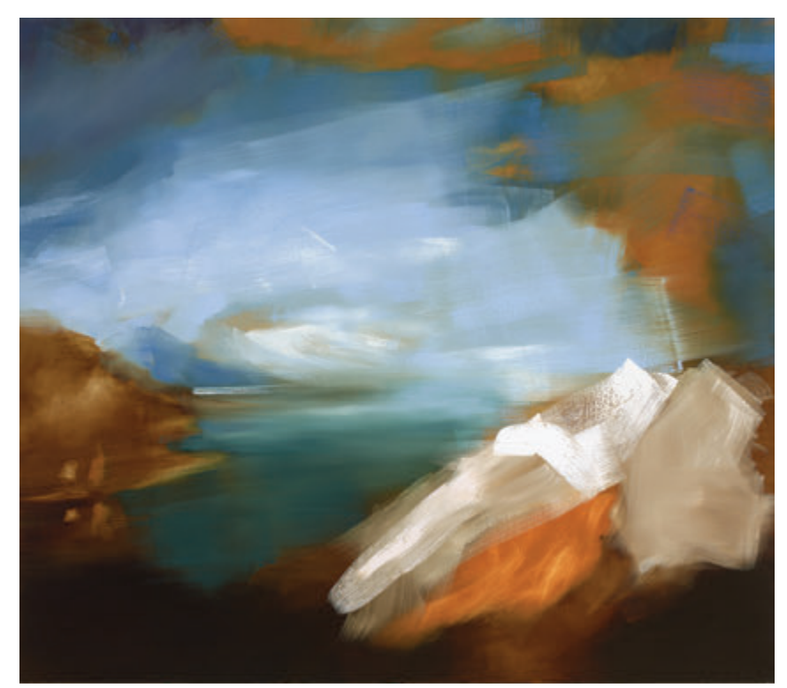
"Sometimes just a few elements from an Old Master source can provide enough material for an entire painting. Here, landscape is the focus. Figures are either omitted entirely or lightly suggested. Reversing the traditional hierarchy between figure and ground enables me to shift the meaning and the read. This is the Rape of Europa without the rape, a celebration of consensual erotic activity."