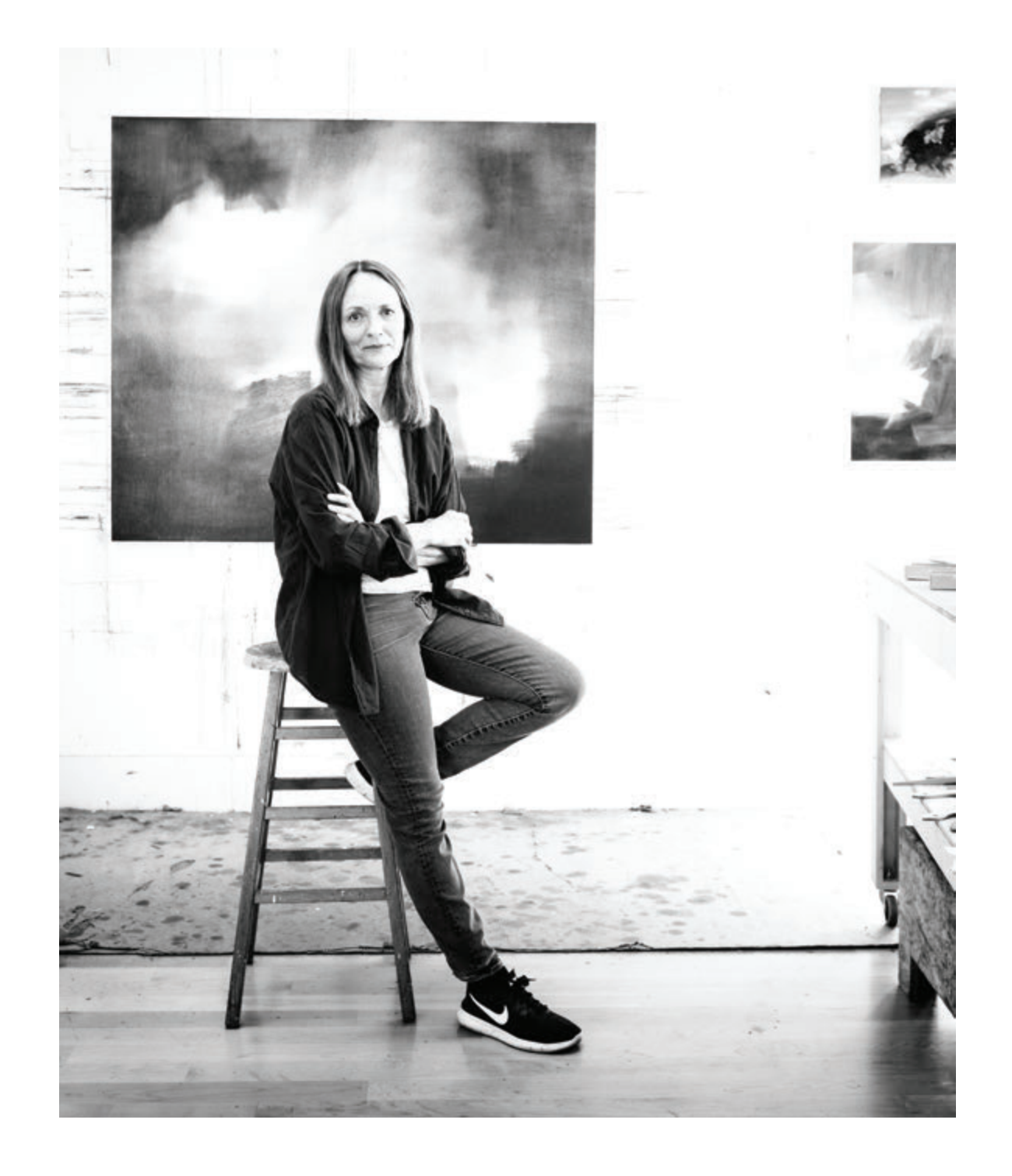
words Stacey\ Kors\ \mid\ portrait photography Winky\ Lewis\ \mid\ art photography Luc\ Demers

painter Elise Ansel interprets the Old Masters with a modern female voice