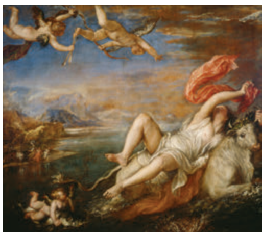
Titian The Rape of Europa, 1560-62 Oil on canvas 70 x 81 inches

Europa, 2018 Oil on linen 52.5 x 60 inches