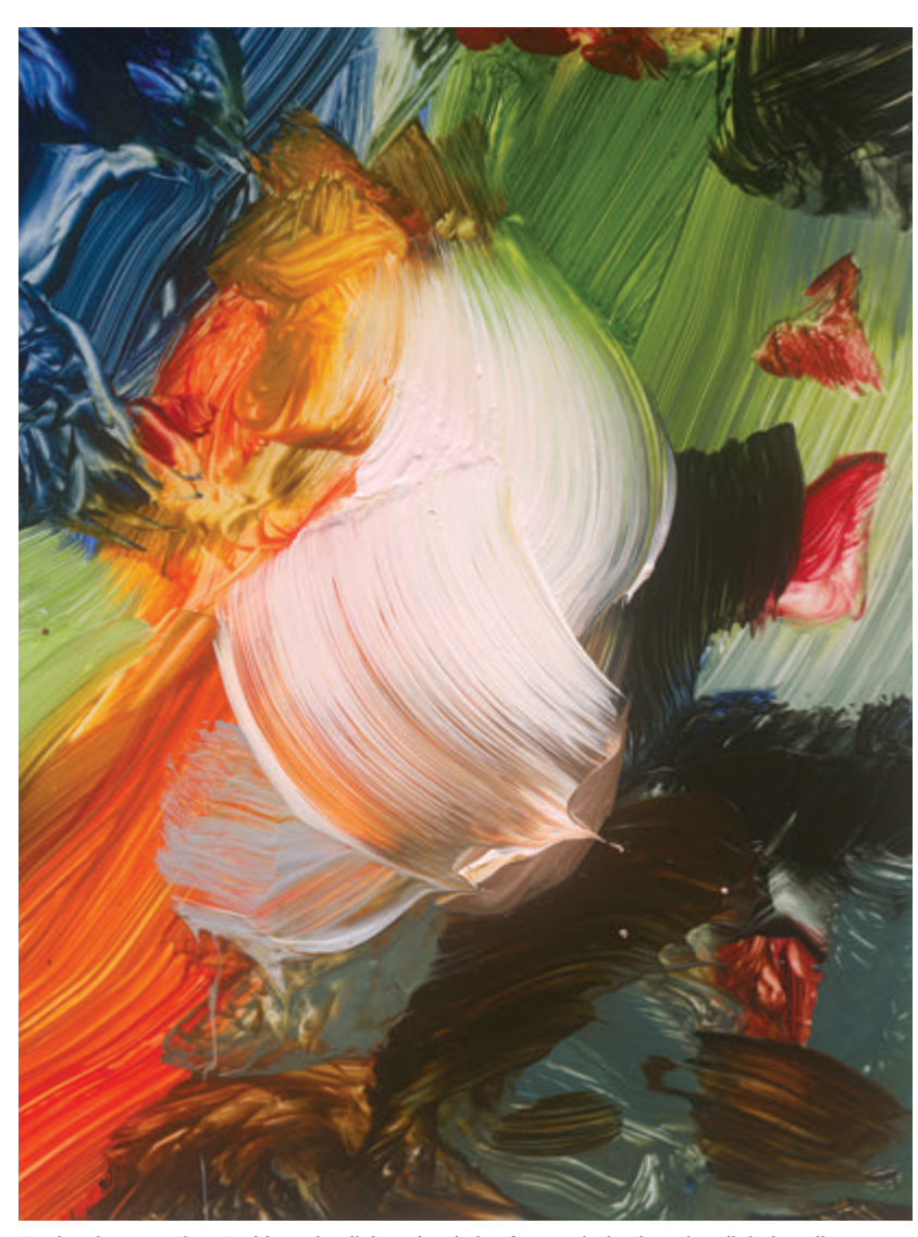
"In the pigment prints, I add another link to the chain of transcription by using digital media to enlarge details of my own small paintings. The prints appear as dimensional as bas-reliefs. Viewers want to touch them. Paradoxically, my intent is to use digital media to highlight the importance of primary sensual experience obtained through the five senses."

Europa, 2018 Oil on linen 52.5 x 60 inches