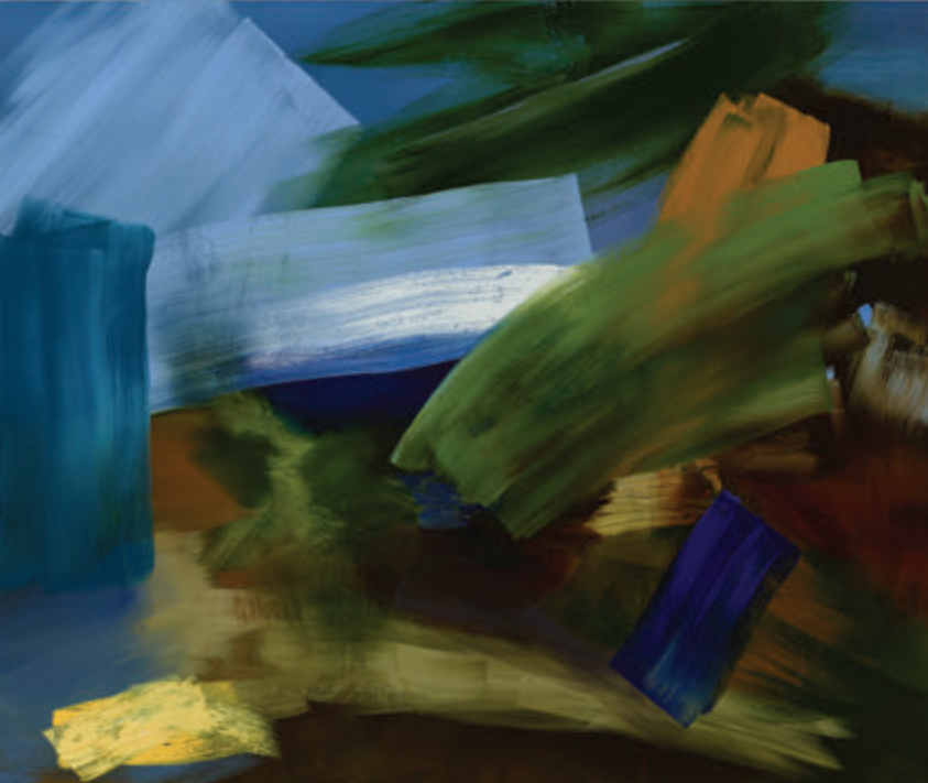
"I mine Old Master paintings for color, structure and meaning. I was attracted to the unbridled energy and sense of dynamic movement in Titian's Bacchus and Ariadne . Titian's painting depicts the moment in the myth when Bacchus, the Roman god of wine, agriculture and fertility, intercedes and tragedy is transformed. In both my painting and Titian's, narrative is the engine that drives the work."

Bacchus and Ariadne (Unpopulated), 2018 Oil on linen 60 x 72 inches