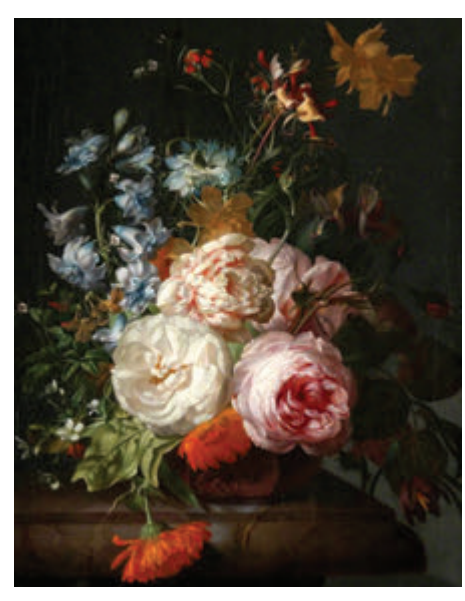
Rachel Ruysch Flowers in a Terracotta Vase, 1723 Oil on canvas 15.5 x 12.4 inches

Aperture (Dutch Flowers I-3), 2018 Pigment print on Hahnemuhle museum etching, mounted on dibond 44 x 35 inches