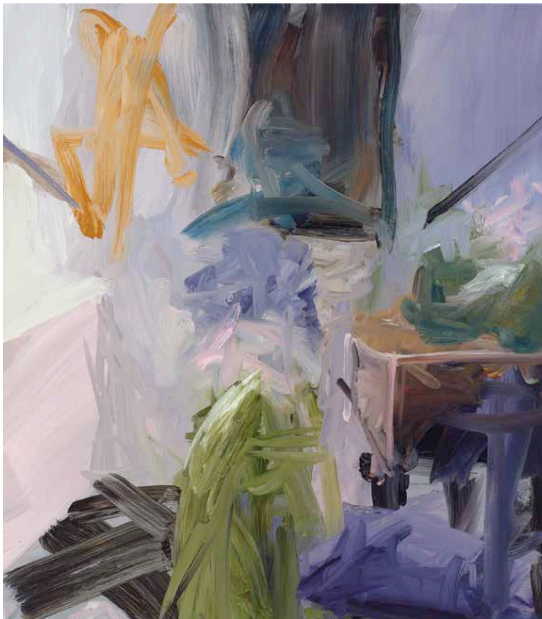
7 Elise Ansel , In Pursuit of a Geometry of an Exact Expression V , oil on canvas, 31 x 27½". Private collection, courtesy Cadogan Contemporary, London, England. Photo by Luc Demers.