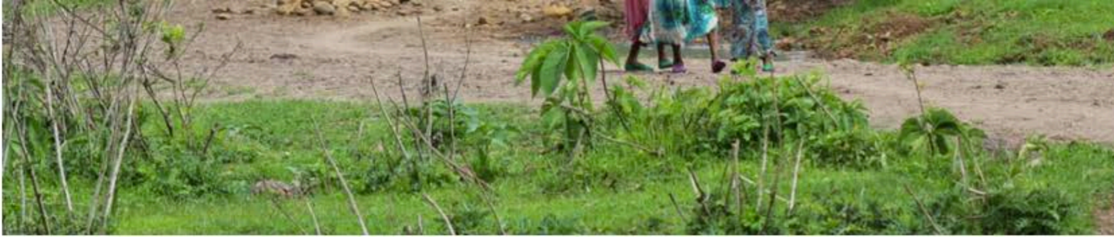
A woman and children return from the fields in Awra Amba.