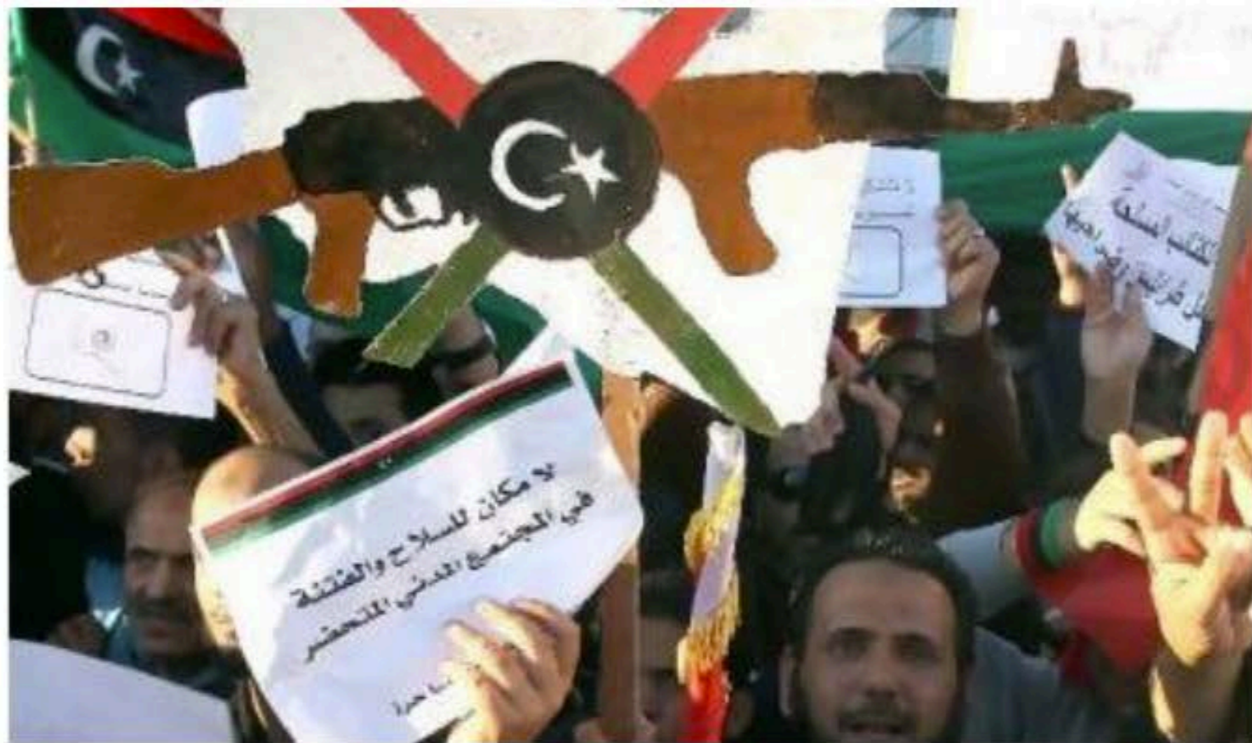
Libyans gather in Tripoli on Thursday to call on the interim government to take control of the problem of illegal weapons.

TRIPOLI // The capital's Martyrs' Square is the scene of almost nightly celebrations of the killing of Muammar Qaddafi.