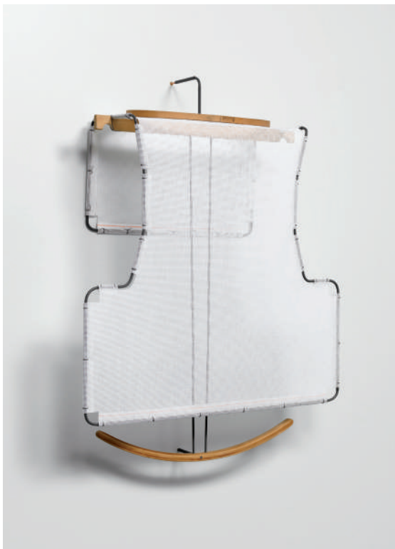
Diane Simpson, Bib (white) , 2006, cotton mesh, painted aluminum, found trunk hanger, found embroidery hoop, 30 × 23 × 8". From the series "Bibs, Vests, Collars, Tunic," 2006–2008.

face, to say nothing of edges, seams, and undersides—or to look through a sculpture entirely. We fixate not on some spectral figure but instead on the full morphology and materiality of each object. None of this is to deny the implications in Simpson's work of and for figural sculpture. Rather, it is to advance what the sculptures themselves advance, that the divide between abstraction and figuration is overdetermined.