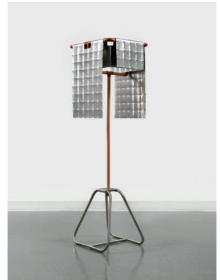
Above: Two views of Diane Simpson's Shawl , 2013, stainless-steel stool base, wooden dowels, copper fittings, embossed aluminum, acrylic and enamel paint, 58½ × 14½ × 17".