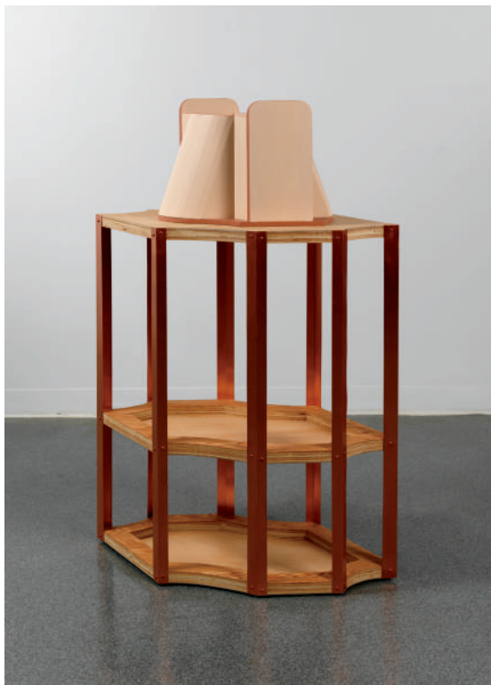
Diane Simpson, Peplum I , 2014, fiberboard, enamel, copper, plywood, 47½ × 29½ × 17". From the series "Peplum," 2014–.

Numerous works, such as Cape , 1990, and Pantaloons , 1988, are skeletal (to use an admittedly anthropomorphizing word)—openwork MDF structures that demonstrate neither lack nor essence, but rather their own formal intelligence. Cape is legible as its titular object, with a solemn, upturned collar and a footprint that approximates the undulation of fabric. The sculpture is larger than human scale, however; the sides and tops of its struts are stained with orange paint, but not the fronts, which perplexes the figure-ground relationship sculpture might seem automatically to secure. As it happens, the work derives from two distinct sources, two modes of covering or protecting: the sixteenth-century European man's cape we recognize and a traditional English thatched roof. Tellingly, when Simpson discusses her works, she avoids the phrase "historical costumes," calling those sources "clothing structures." The sculptures