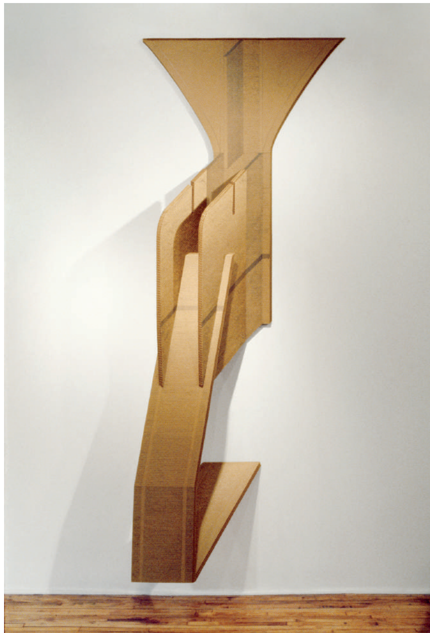
Diane Simpson, Corrugated Drawing , 1978, corrugated board, graphite, 110 × 46 × 18". From the series "Corrugated Cardboard," 1978–80.

Simpson’s axonometry is more intuitive than technical, a personal but diligent system. Since 1978, she has taken the grid of graph paper and a straight ruler as