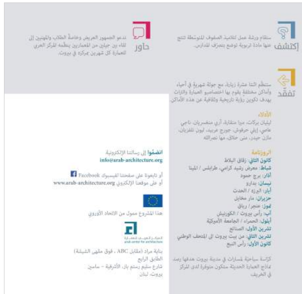
["Revealing Architecture" Leaflet, p.2: One of ACA's Dissemination Projects.]