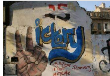
[جغرافيتي من ميدان التحرير في القاهرة]

أدى التحضر السريع للعالم إلى بناء مدن لم تتأسس حول مستخدمي الحيز المدني، بل لخدمة ضرورات جني الأرباح. لقد حاول الأثرياء وأصحاب النفوذ بناء وتشكيل هندسة ومشهد عام للسيطرة وللحصرية، بشكل يؤدِّد قوتهم وثروتهم. تمَّ نحت انعدام العدالة الاجتماعية المترابدين داخل الأشكال المكانية للمدن في جميع أنحاء العالم. قد يكون سكان ومستخدمو الحيز المدني أبرياء، إلا أن الممولين والسياسيين والمحترفين الذين يبنون مدينة لا يمكن أن يكونوا أبرياء أبداً.