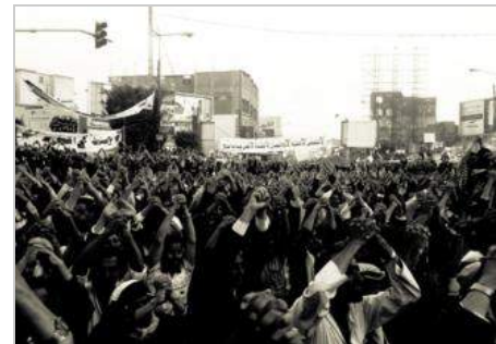
[Solidarity in Sana'a, Yemen on March 6.]

Comparisons have frequently been drawn between the Arab uprisings and the revolutions in France in 1789 , Europe in 1848, Prague Spring 1968 , Eastern Europe and the Soviet Union in 1989, and, on a few occasions, to the Arab revolt and the Egyptian Nasserite revolution in 1952 . The 1962 Republican Revolution in North Yemen, however, has been largely overlooked. Much like the Yemeni uprising of 2011, the Republican Revolution, in the words of Gamal Abdul