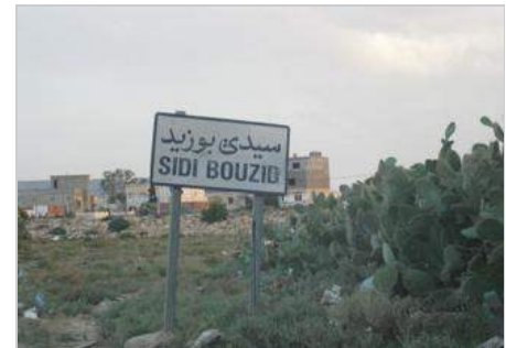
[Sidi Bouzid, Tunisia. ]

Despite urban spaces outside the major metropolises remaining almost invisible in discourses surrounding the Arab uprisings, small cities played a critical role in the revolts in 2011, the year that changed the Middle East. Normatively, it is the spaces of the largest cities that are deemed to produce the region's history. Cairo, Beirut and Baghdad, and their ilk, do not form the realities for the majority of inhabitants in the Arab region, however. Urban morphologies of small cities, such as Sidi Bouzid, Suez and Dera'a, are closer to the everyday spatial realities of the majority of the regions inhabitants. The Arab uprisings have articulated how the neglect of areas outside the major metropolises hindered our understanding of human patterns of social life.