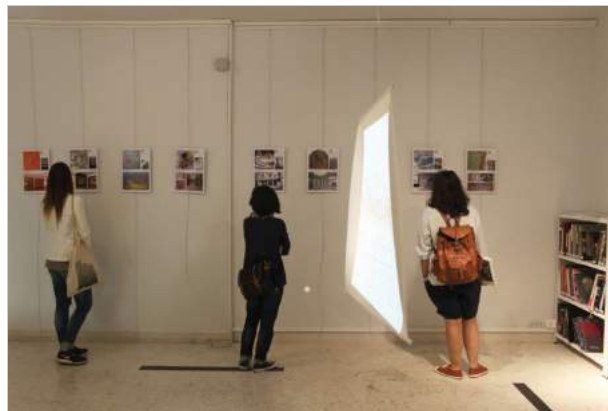
[Exhibition at ACA. Photo ACA]