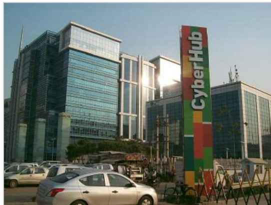
[Figure 2: Gurgaon, India.]

Two central issues emerge, however, in the conference’s approach to integrating the global south into the debate on global suburbanism(s). Firstly, the script of urban theorizing cannot be rewritten when the concept, namely the suburb,