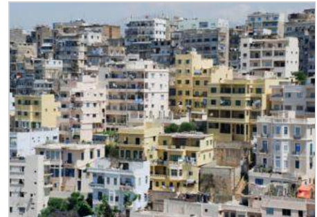
[Figure 1: Suburban Tripoli? The Urban Fringes of Tripoli, Lebanon.]

Suburbanization is the crucial aspect of twenty first century urban development, as now most global urban growth is in the form of peripheral or suburban development. This is the central claim made by the organizers of A Suburban Revolution? An International Conference on Bringing the Fringe to the Centre of Global Urban Research and Practice . [1] The Suburban Revolution? conference is part of a Canadian-funded Major Collaborative Research Initiative (MCRI) entitled “Global Suburbanisms: Governance, Land, and Infrastructure in the Twenty First Century (2010-2017),” which includes fifty scholars and many more students working worldwide. The project seeks to contribute to foundational thinking on suburbanization. Roger Keil, the principal organizer of the conference, argues we must realize that the “urban century” is rather the “suburban century.”