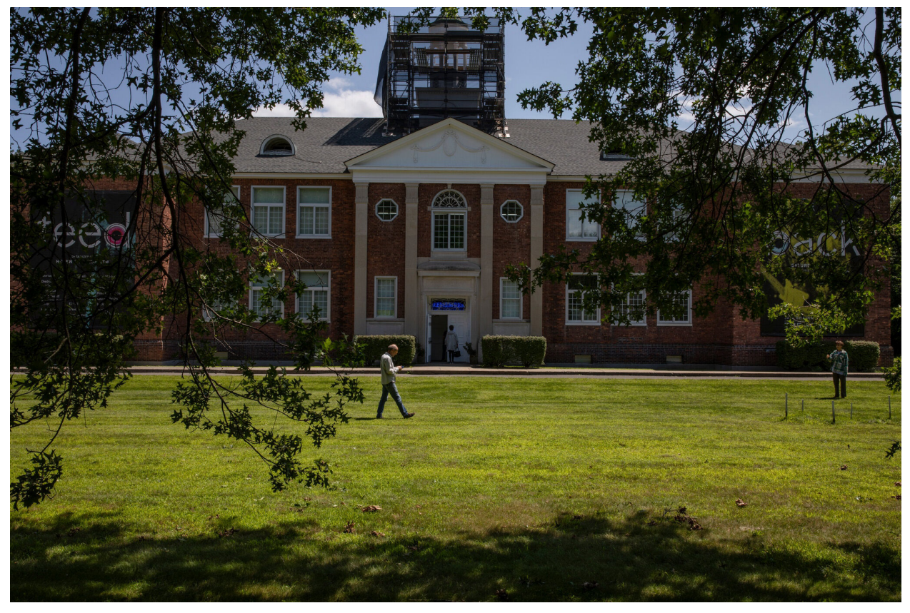
Jack Shainman Gallery's outpost, The School, in Kinderhook, N.Y.

tension between his protest and the song's usual bombast, which he also captured, that really summed up his historical moment and made the rendition iconic.